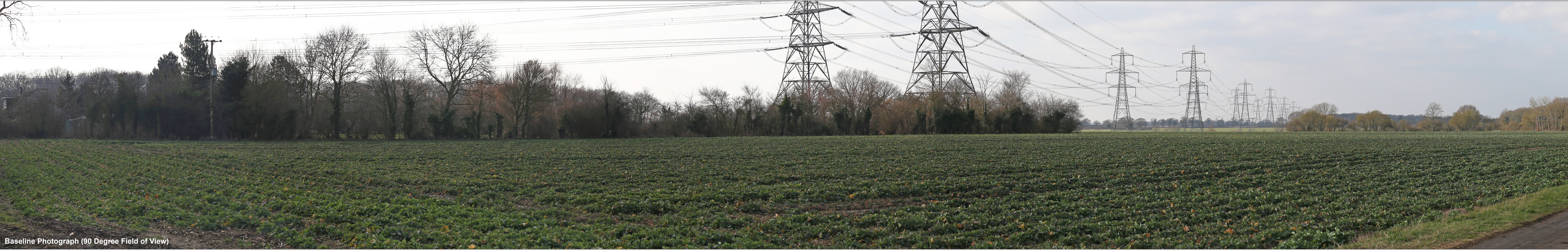
Baseline Photograph (90 Degree Field of View)