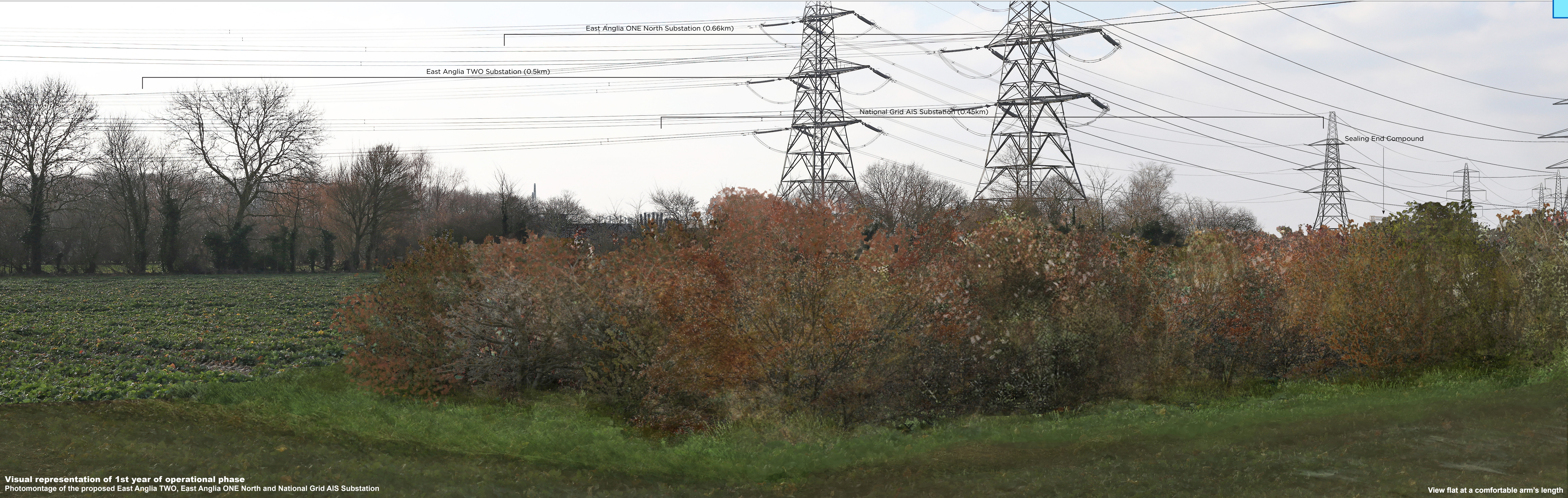
Visual representation of 1st year of operational phase Photomontage of the proposed East Anglia TWO, East Anglia ONE North and National Grid AIS Substation