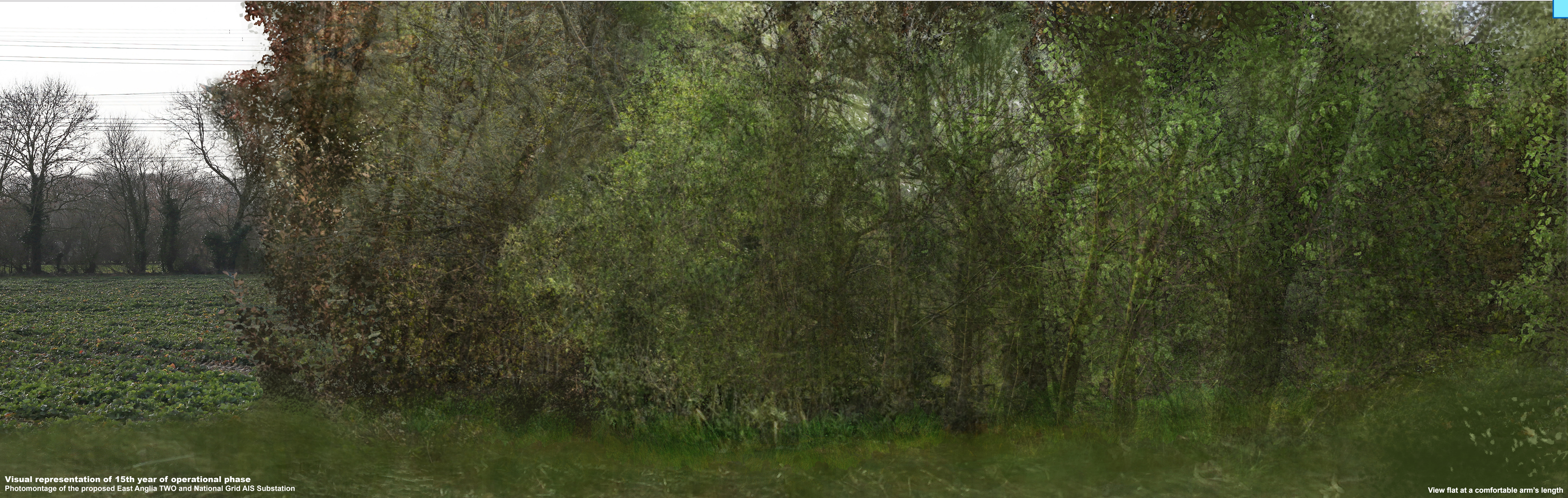
Visual representation of 15th year of operational phase Photomontage of the proposed East Anglia TWO and National Grid AIS Substation