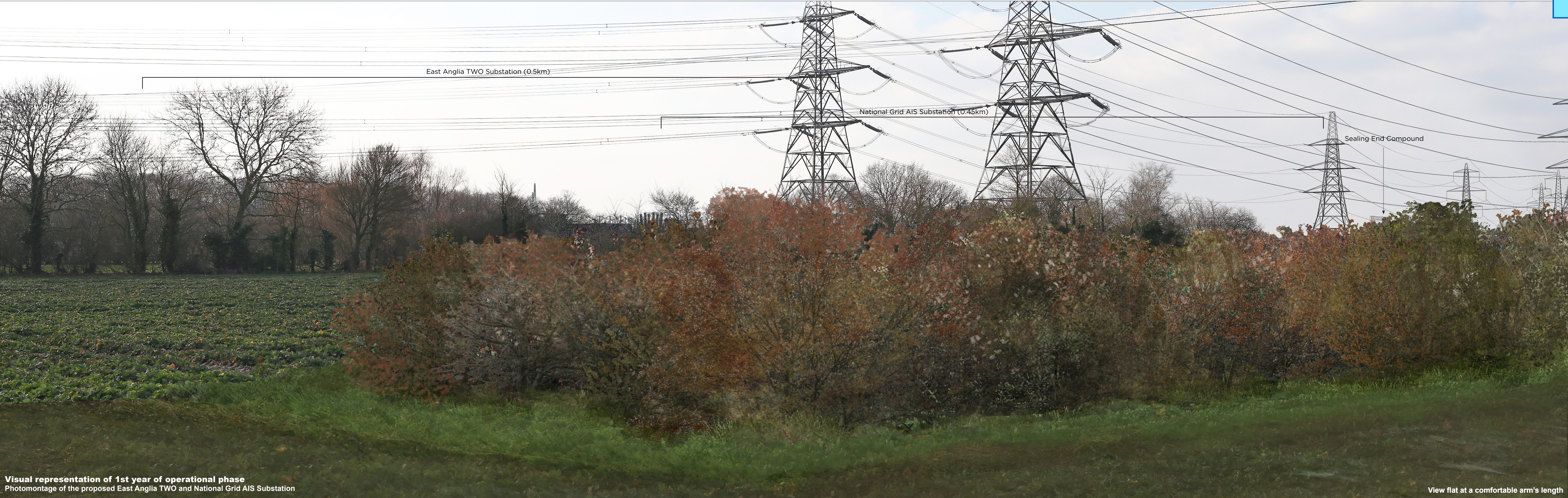
Visual representation of 1st year of operational phase Photomontage of the proposed East Anglia TWO and National Grid AIS Substation