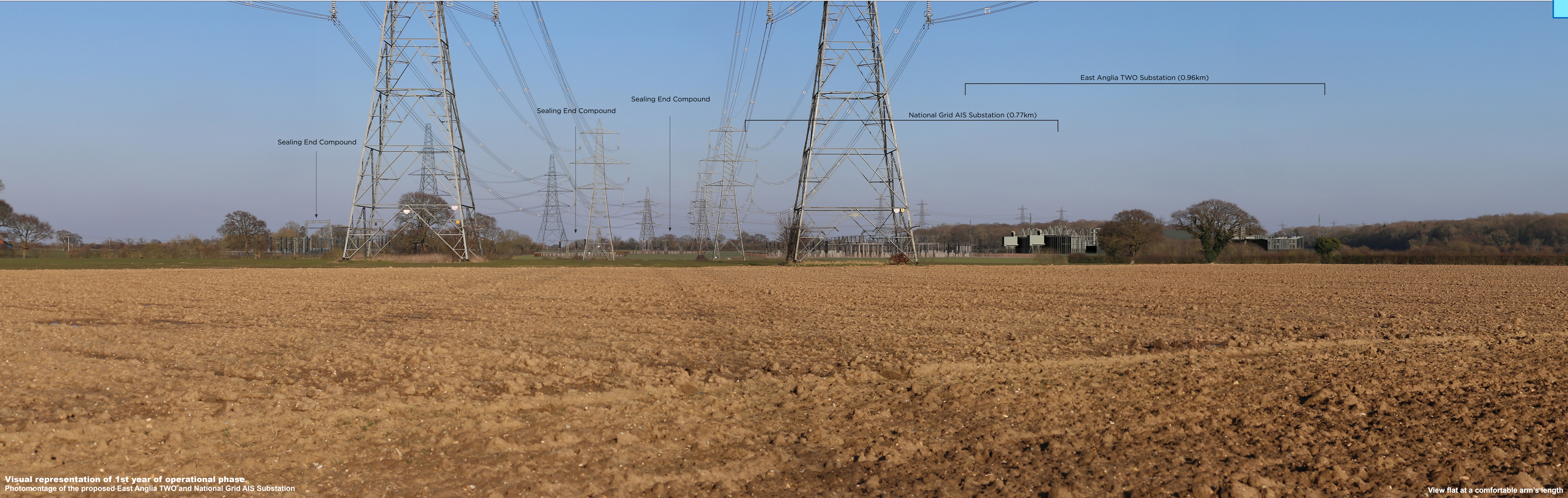
Visual representation of 1st year of operational phase Photomontage of the proposed East Anglia TWO and National Grid AIS Substation