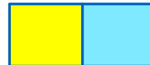
Table 3 Water Resources and Flood Risk