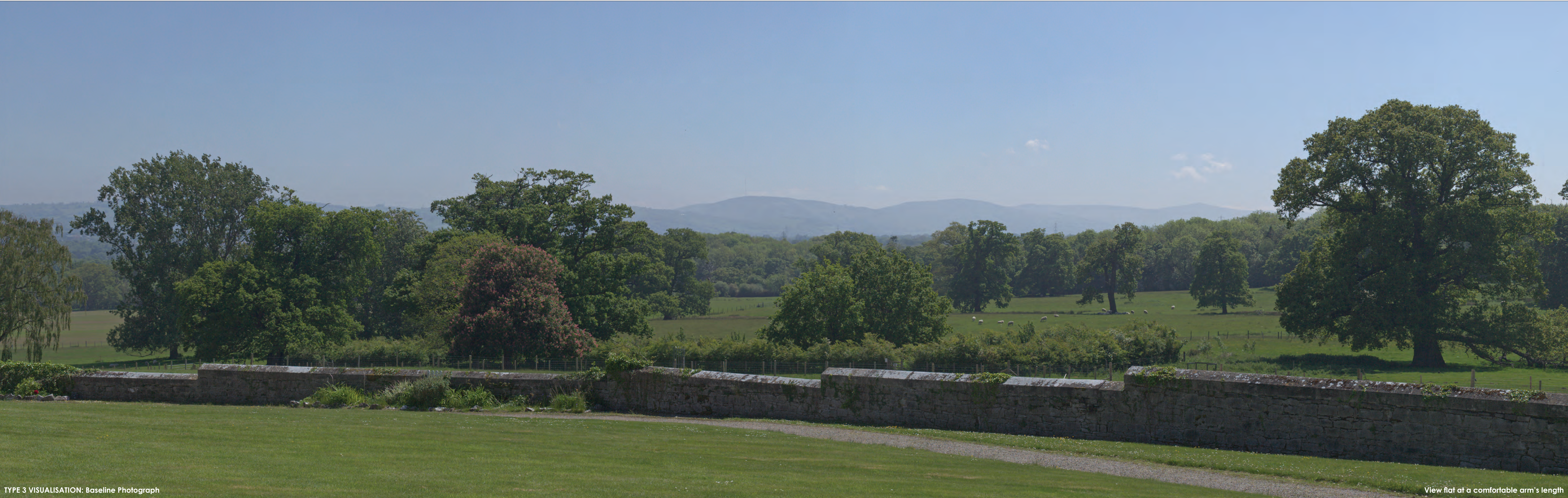
TYPE 3 VISUALISATION: Baseline Photograph