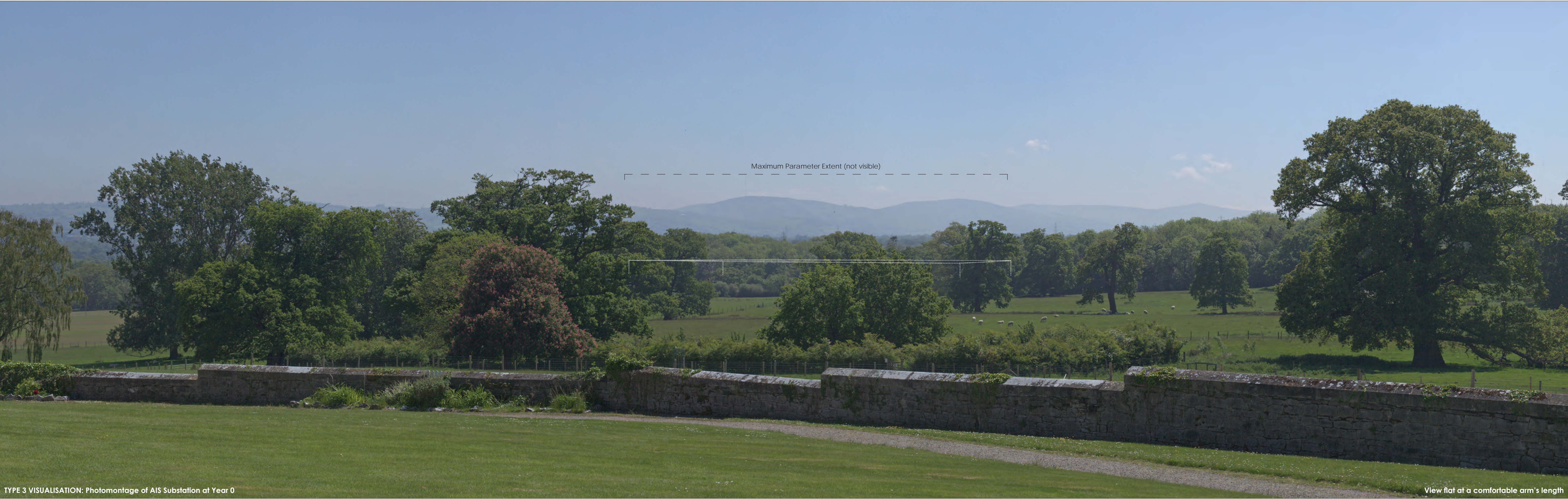
TYPE 3 VISUALISATION: Photomontage of AIS Substation at Year 0