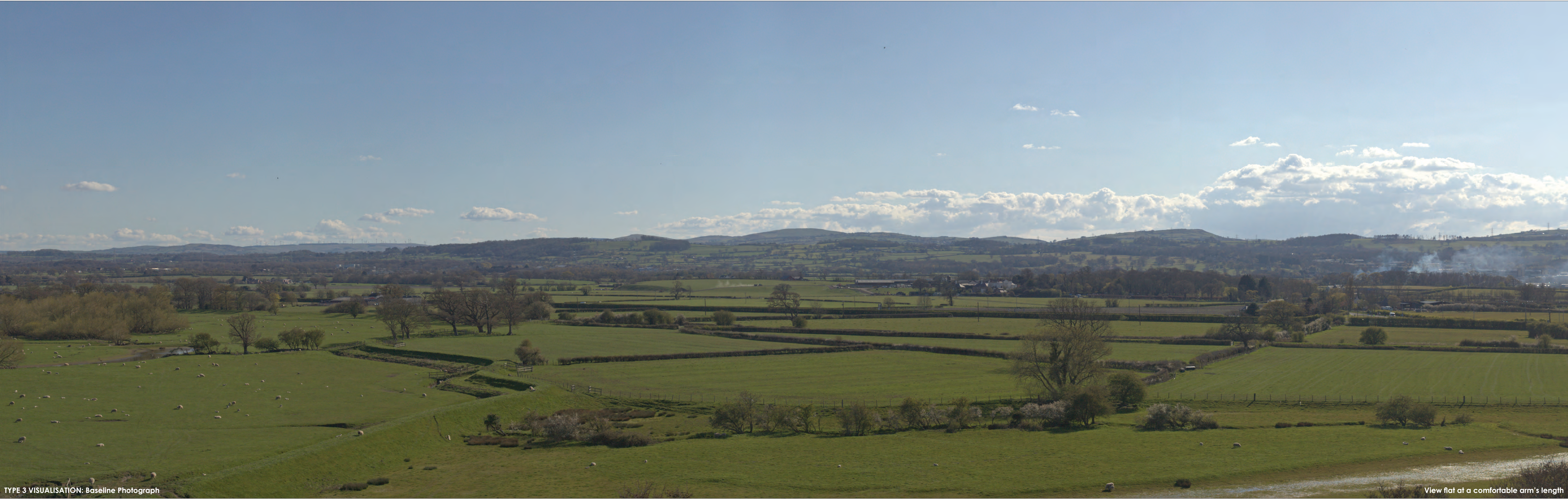
TYPE 3 VISUALISATION: Baseline Photograph