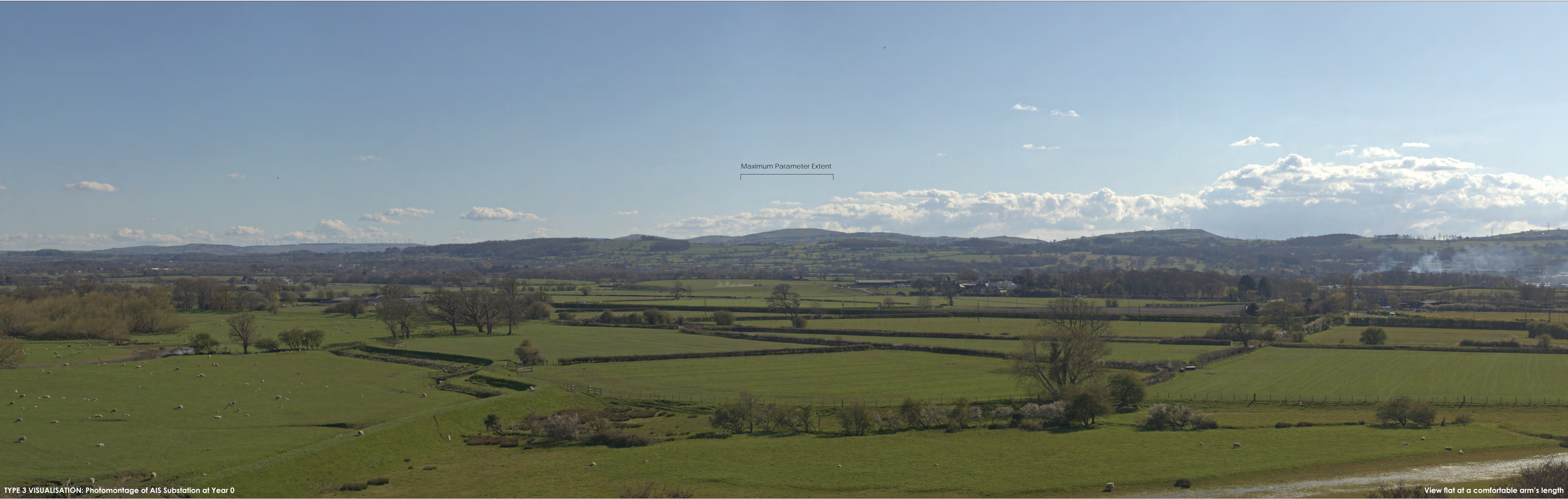
TYPE 3 VISUALISATION: Photomontage of AIS Substation at Year 0