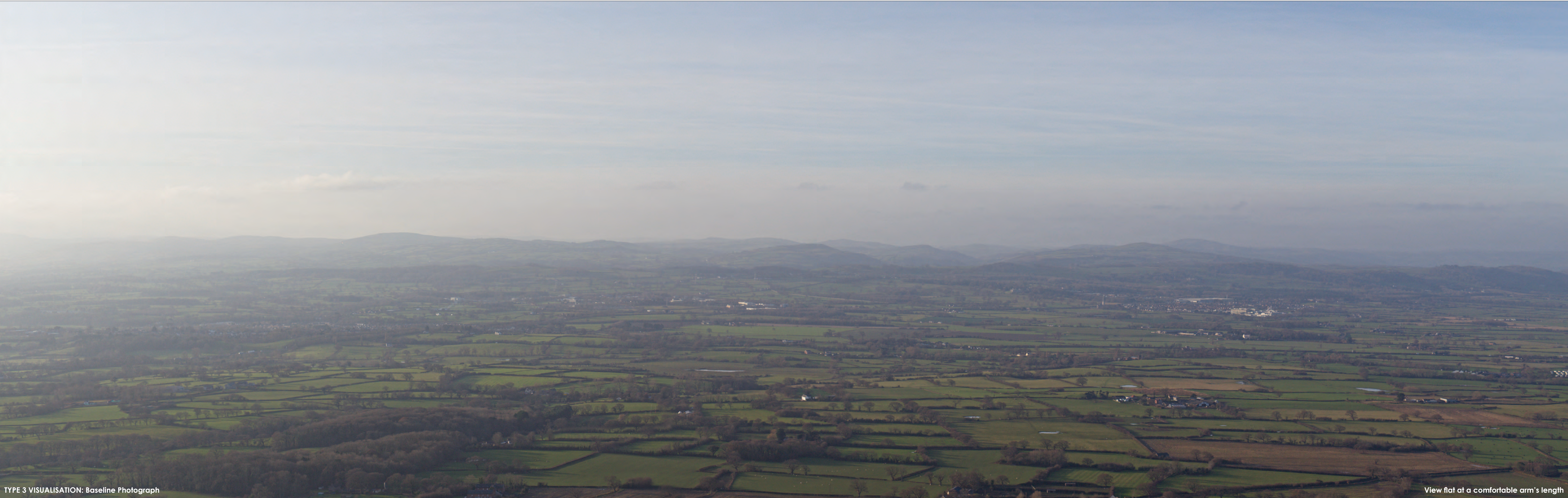
TYPE 3 VISUALISATION: Baseline Photograph