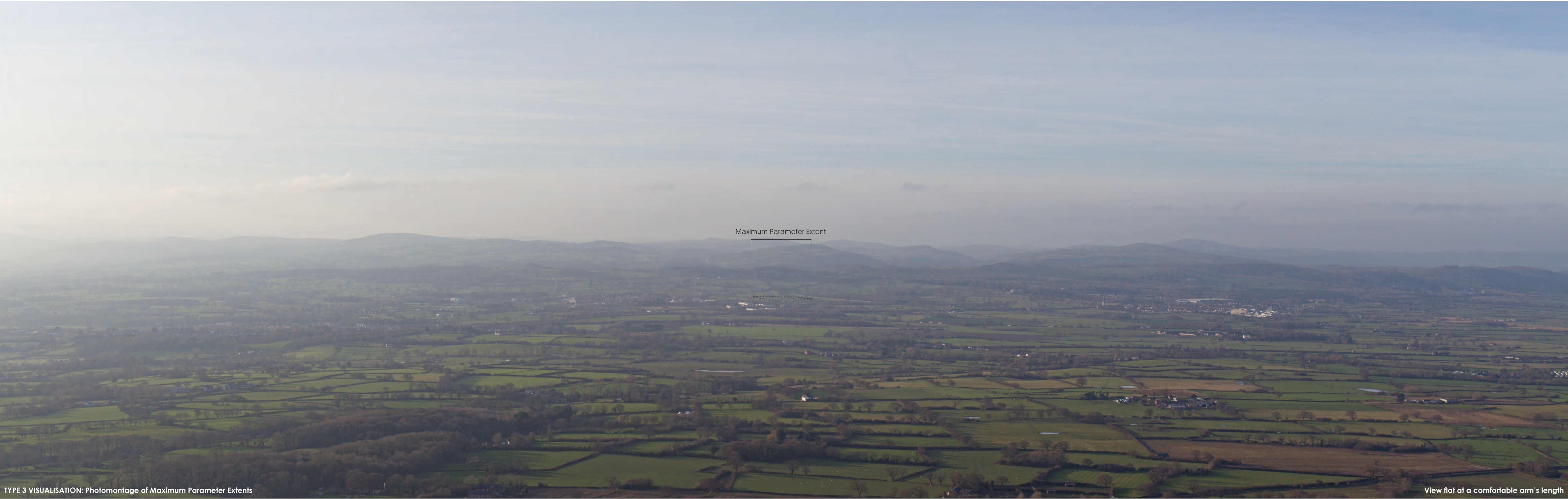
TYPE 3 VISUALISATION: Photomontage of Maximum Parameter Extents