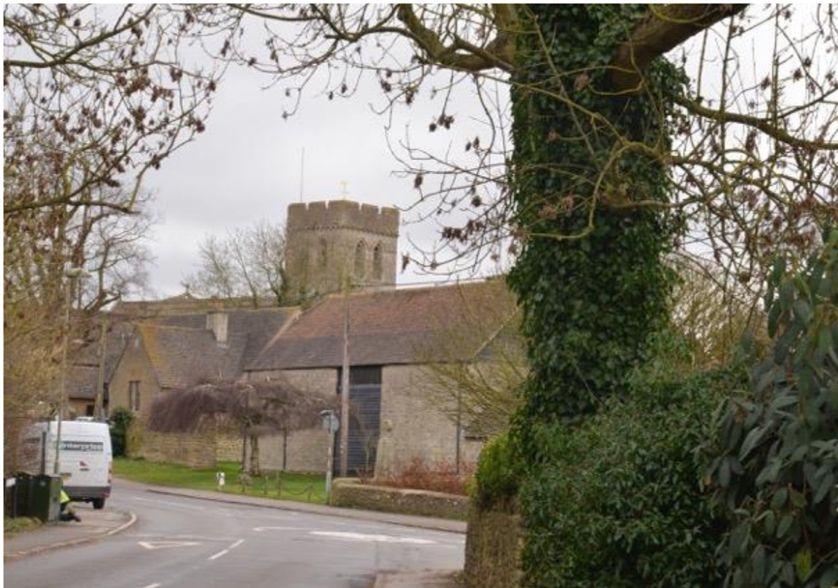
Cumnor High St showing church, tithe barn and old school

Cumnor village is the historic centre of the parish. The Church of St Michael dominates the centre at the junction of the main historic routes through the village. Traditional houses of differing styles and dates can be found along the village streets, including public houses, the old school, farms and farm buildings. One notable characteristic of the centre is its openness. The church is set back from the road in a generously-sized churchyard and the site of the former Cumnor Place, adjacent to the church with its grounds and fishponds also provides a large open space.