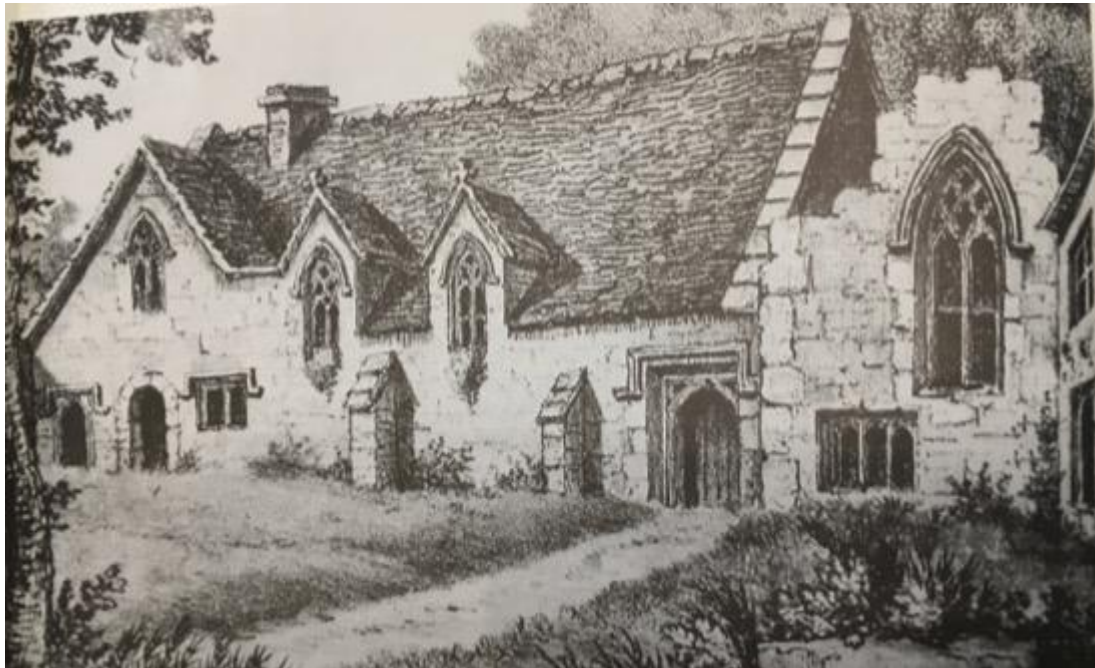
Fig.3 Cumnor Place c.1809 just prior to its demolition

Anthony Forster purchased the lordship of Cumnor manor in 1561, already being a tenant at Cumnor Place. He enjoyed the patronage of Robert Dudley, later Earl of Leicester. It was in Forster's time, 1560, that Amy Dudley (nee Robsart) met her untimely and mysterious death at Cumnor Place, an event to which Sir Walter Scott's novel 'Kenilworth' in 1821 drew much interest and notoriety. Forster was the last, perhaps the only, lord of the manor to reside in Cumnor Place. It was afterwards to fall gradually into decay and ruin, being demolished in 1810, see Fig 3.