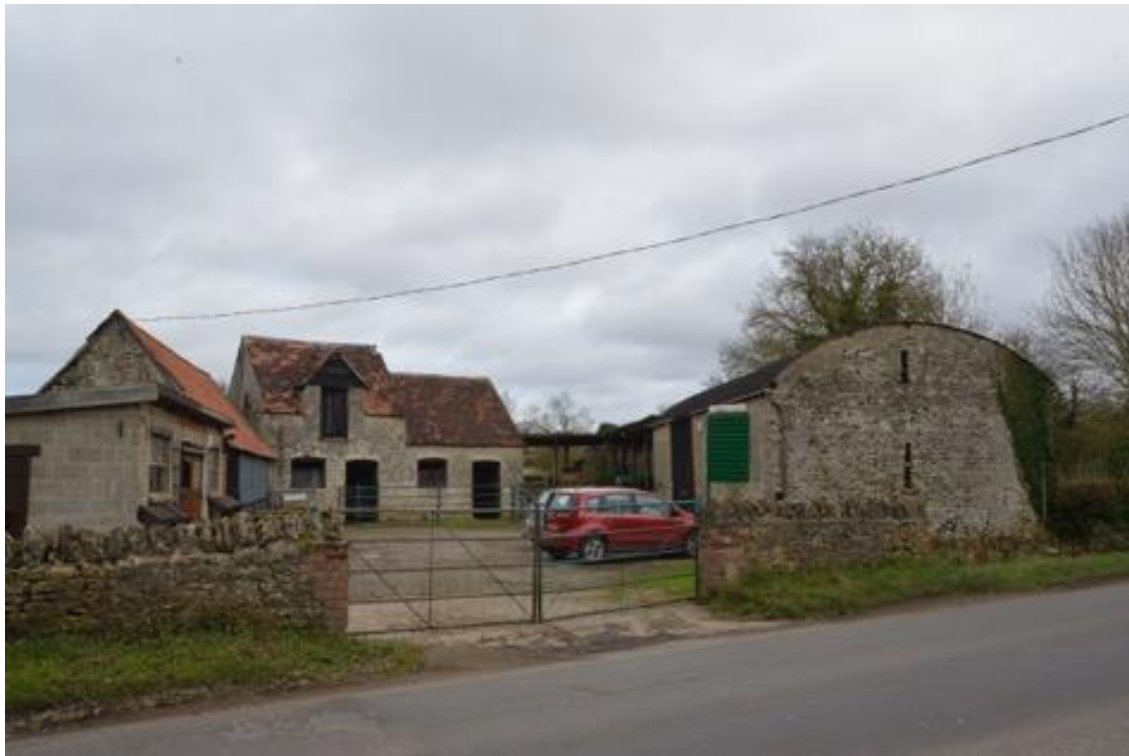
Fig.5 College Farm

generally constructed of rubble stone with tiled or thatched roof and twentieth century buildings are mostly of brick and slate. There were several farms within the village and this is reflected in the surviving farm buildings, see Fig.5.