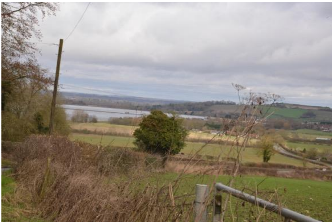
Fig.7 View from Tumbledown Hill towards Farmoor

The land surrounding the village and the twentieth century housing is characterised by gently undulating, unspoilt countryside rising to the wooded slopes of Wytham Hill in the north and the Cumnor Hurst to the south. Hurst means wooded hill and interspersed amongst arable fields are patches of ancient woodland. The land to the west bordering the river is much lower and fairly flat. Farmoor reservoir occupies the site of Cumnor Mead, the flat meadows of the parish, see Fig.7. Isolated farmsteads, mostly pre-enclosure, contain much information about past farming in the parish. Agriculture was the principal economic activity in the parish until the twentieth century. Chilswell, an isolated manor in the south east of the parish, lies on the unmade road linking to the old turnpike road.