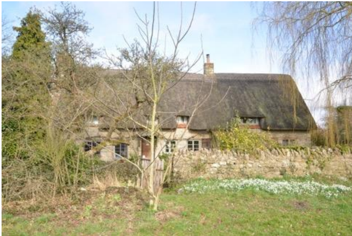
Figure 6 Strong rural character within the village

There may be evidential value in some of the early buildings within the village whose development has not been investigated. Evidential value is considered to be high.