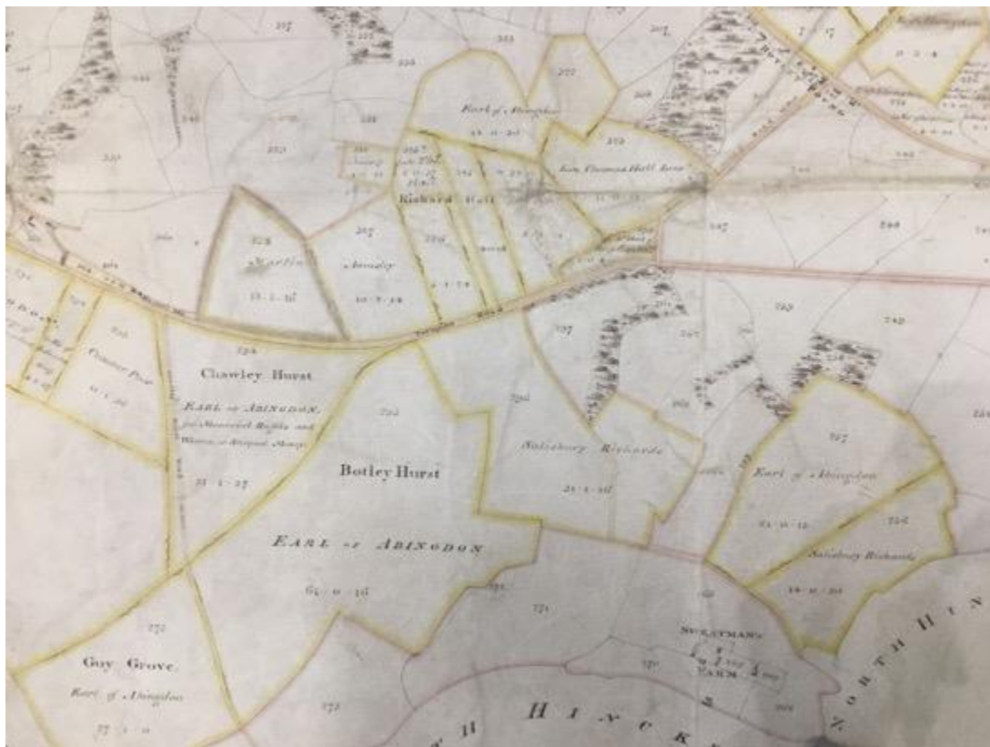
Site of Cumnor Hill showing the turnpike road prior to any development

The turnpike road from Botley to Cumnor was the main route west, climbing up the hill which was quite steep in places. The new road of Cumnor Hill was designed to have a steady gradient facilitating an easier climb for horses. This became the main route superseding the turnpike road of which all traces have been lost apart from a short stretch on Hurst Lane.