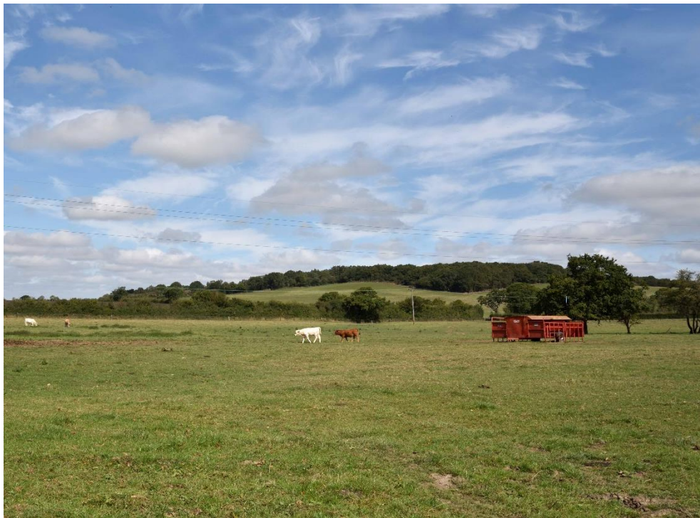
View 13 From Oxford Greenbelt Way, open farmland backed by Hurst Hill

Additional Evidence: There are some important views from the Oxford Greenbelt Way towards the AONB where rows of trees and hedgerows screen the nearby Oxford Road. Cumnor NP Landscape Character Assessment Para 17.5.6