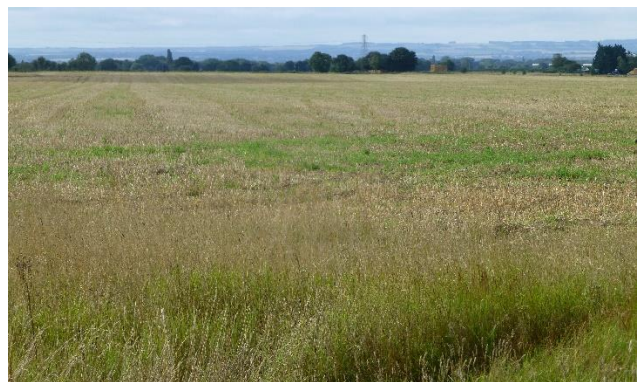
View 30 From Cumnor Hill Top towards The Hurst, Boars Hill, and Henwood. Beyond are Wantage, Harwell and the Berkshire Downs