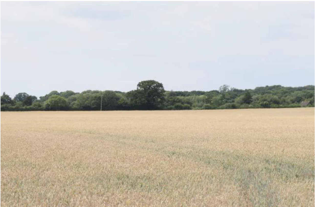
View 5 Red House Farm looking north-east

Additional Evidence: View from Eynsham Road looking north east showing the woodland.