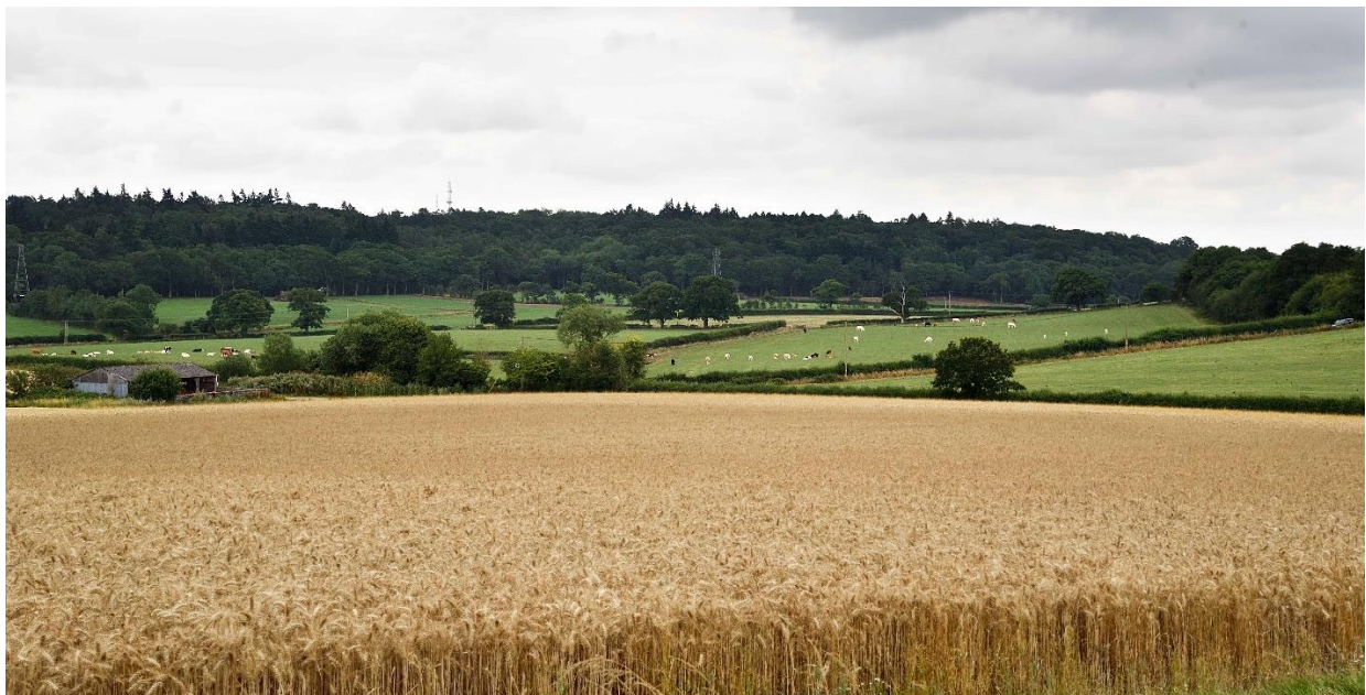
View 12a From Cumnor Beacon, looking Southwest over farmland to Hurst Hill

One of the best examples of Important Views within the Parish where the view as seen by an observer also contains land in different parishes, different districts and, in this case, another county, Buckinghamshire. Visible to the NE are the hills beyond Bicester at Waddesdon, to the ESE the line of the Chilterns at Shotover in the Chilterns AONB, more than 25 kilometres distant, and to the WNW the hills to the north of Burford in the Cotswolds AONB.