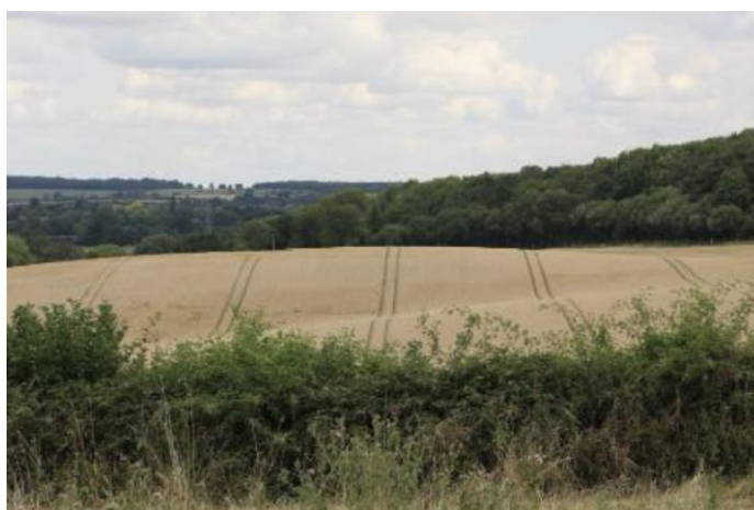
View 4 Views from near summit of Beacon Hill