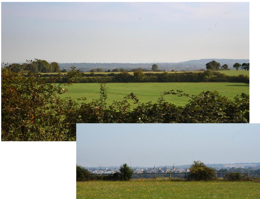
View 28 Limekiln

Content of View: A lower elevation version of 29 with a closer view of Chilswell Farm. Another example of a kinetic Important View within the Parish where a short distance away 'the dreaming spires' that lie outside the Parish are revealed in the valley, as the inset below shows.