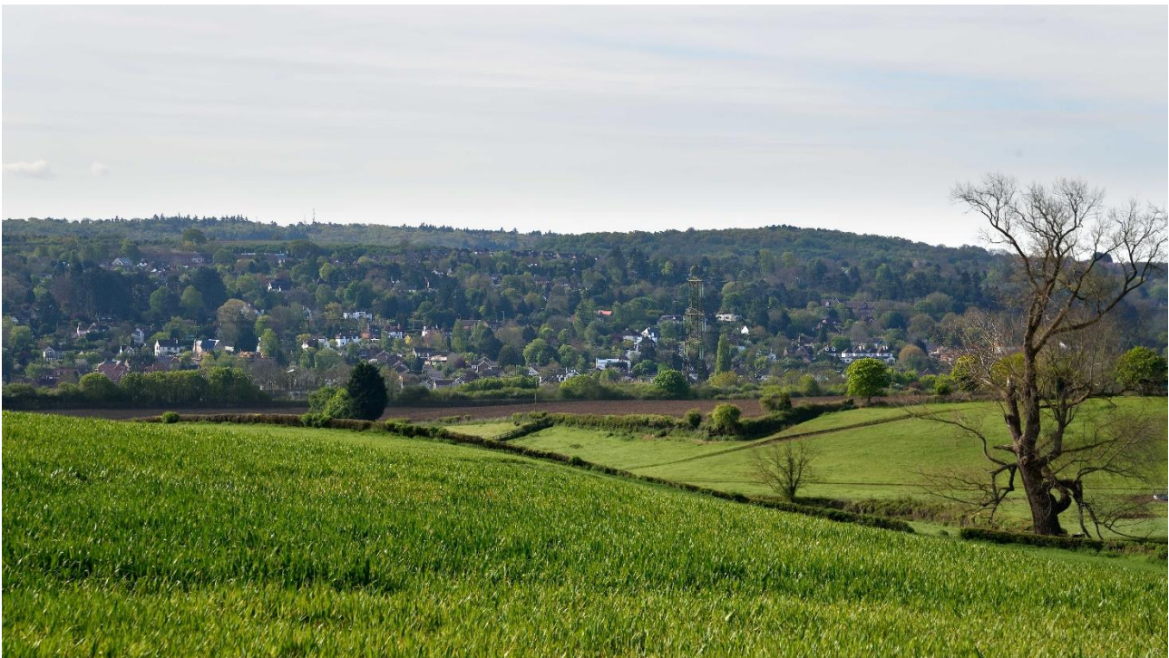
View 23 Tilbury Farm, Dean Court valley and Cumnor Hill from the Singing Way, Wytham Woods.

Additional Evidence: The contours of the land also allow views to the north. Large fields across the LCA provide a sense of exposure and openness. There are rolling hills juxtaposed against the vertical tree line.