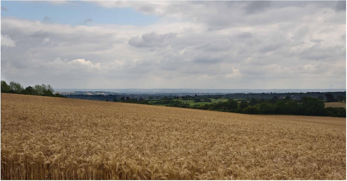
View 12b From Cumnor Beacon, looking Southeast over Thames Valley onto the Chilterns