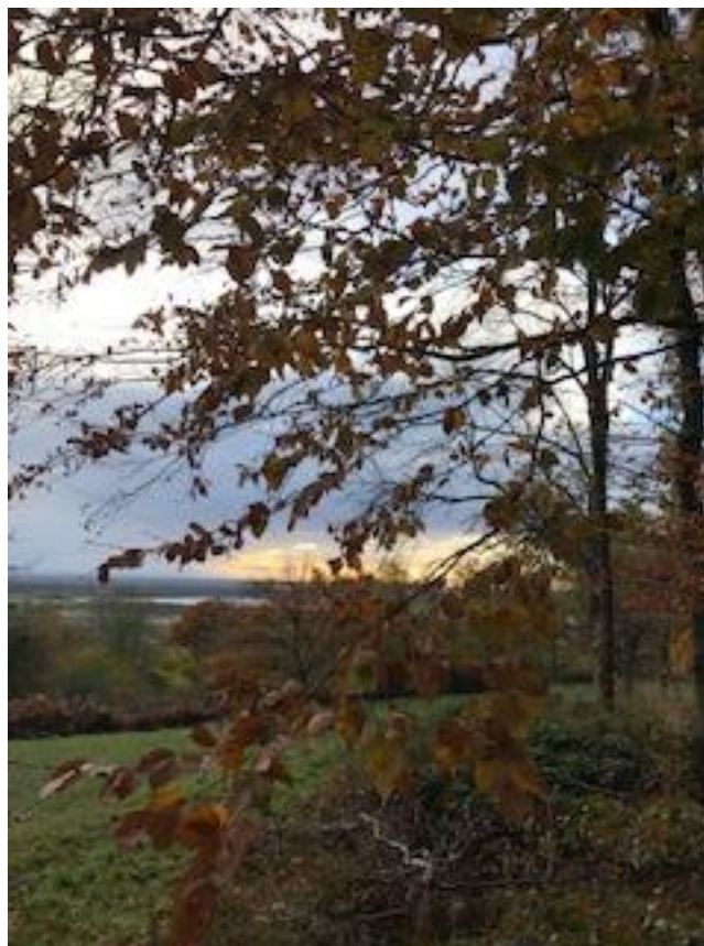
View 1 Elevated view to Farmoor village and the reservoir

Landscape Character Assessment LCA5 Para 9.5.2