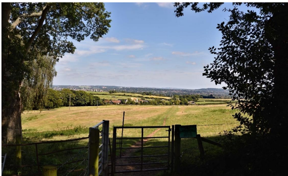
View 14b Chilswell Farm, showing Thames Valley in background