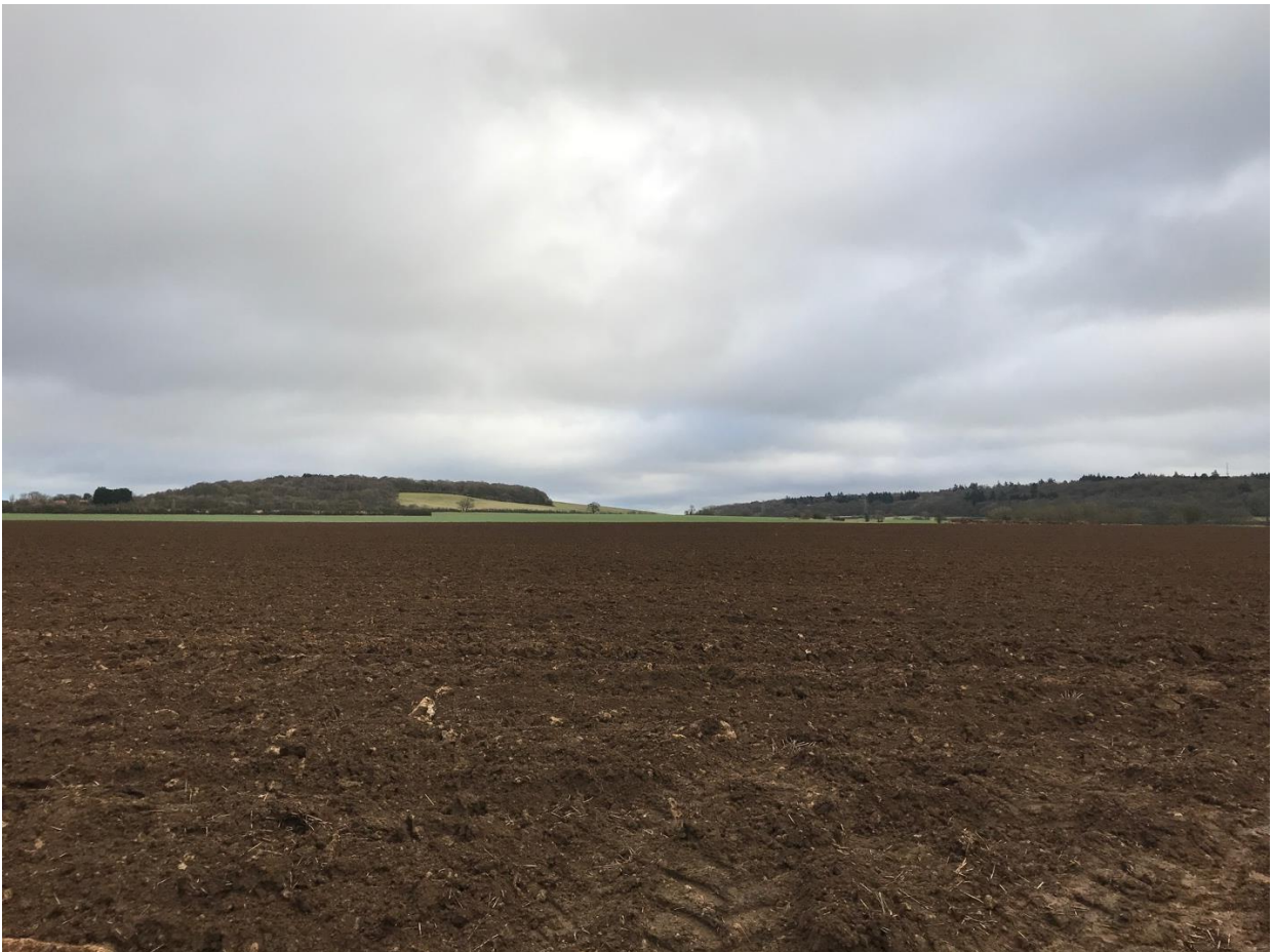
View 8 View from Bradley Farm to The Hurst & Youlbury Woods

Additional Evidence: There is an important view from Bradley Farm to The Hurst and the rural landscape with a wooded backdrop of the SSSI. Cumnor NP Landscape Character Assessment Para 14.5.4