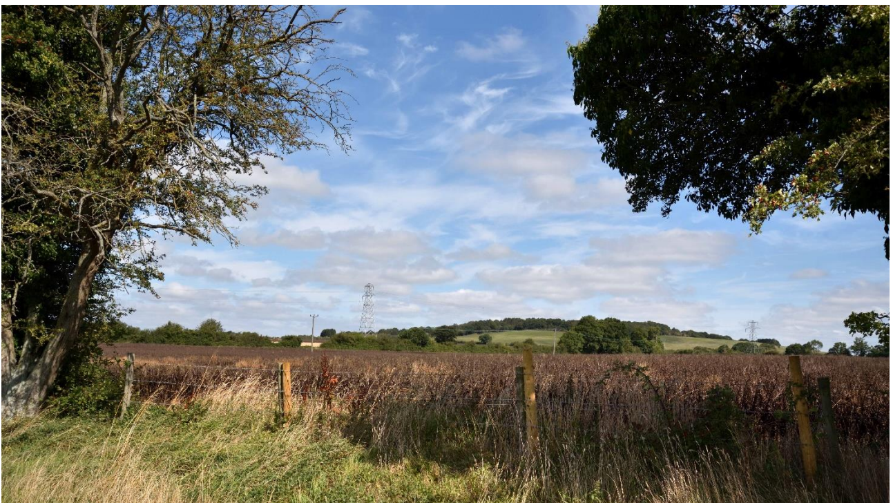
View 26 Hurst Hill seen across land of Bradley Farm from Greenbelt Way.

Additional Information: One of many important views from the Oxford Green Beltway towards the AONB. Cumnor NP Landscape Character Assessment para 17.5.5 & 17.5.6