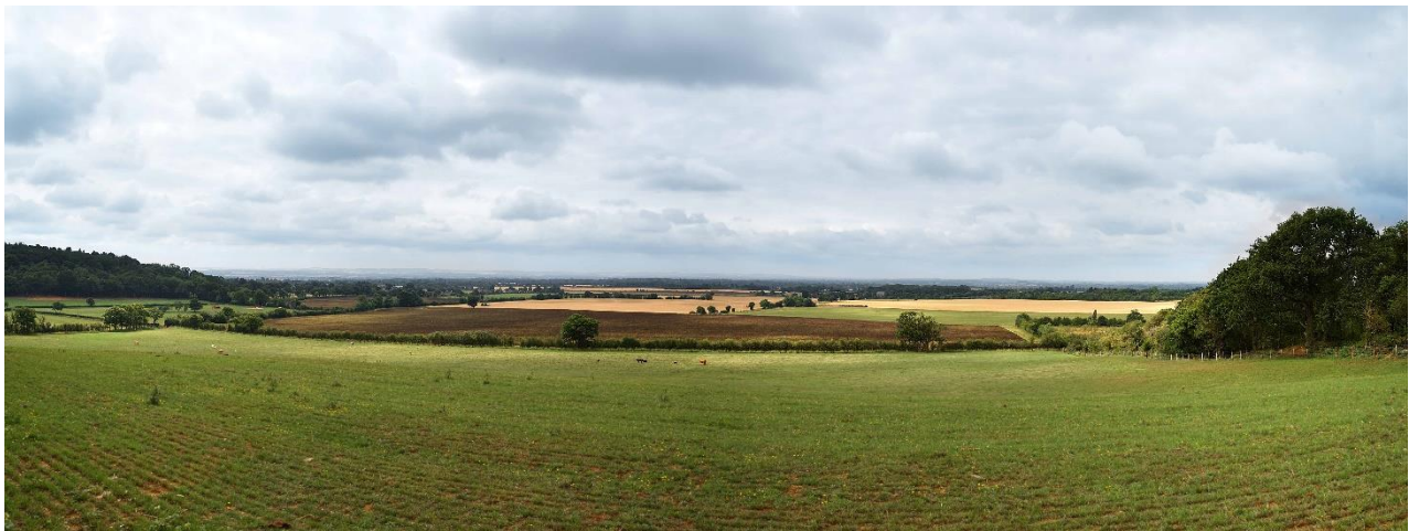
View 9 (photo above and below) From Hurst Hill, showing Henwood and Rockley, and beyond the parish the Vale of White Horse and Berkshire Downs.

Additional Information: The area is relatively open, with views across the arable farmland. This is a large-scale landscape with large open fields relatively undisturbed by development. Long open views are visible beyond the Parish towards Didcot and Berkshire Downs. There are occasional long distant views of the North Wessex Downs AONB on the horizon. Cumnor NP Landscape Character Assessment para 17.5.5 & 17.5.6