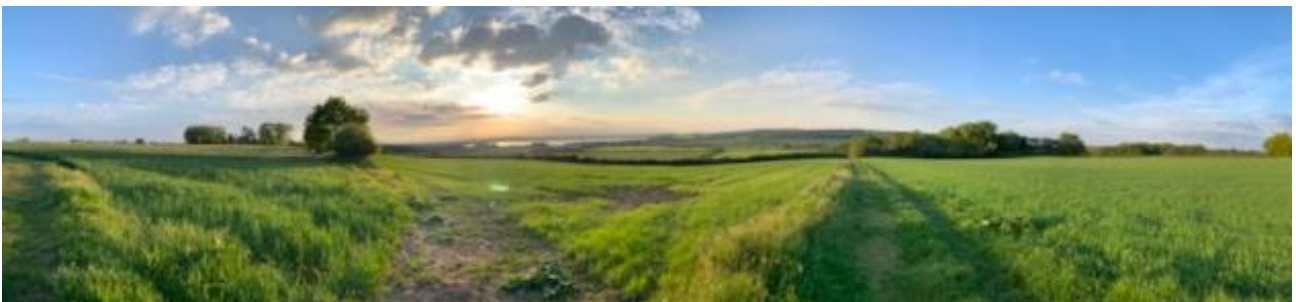
View 24 Panorama of Denman's Farm towards Farmoor Reservoir

Additional Evidence: The north facing slopes have wide views north over the Thames Vale, including Farmoor reservoir, as well views of rising ground including wooded Wytham Hill on the horizon to the north. There are panoramic views north from the B4017. In its recommendation to plan manage and protect distinctiveness the VoWHDC Landscape Character assessment states actions should be taken to 'preserve the important panoramic views to Wytham Woods to the north'.