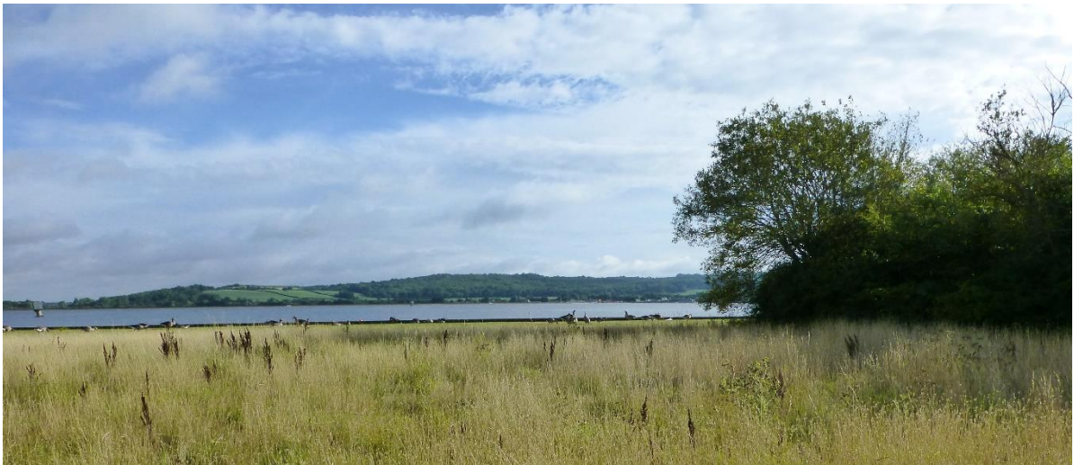
View 2 Farmoor Reservoir & Wytham Woods from surrounding embankment.

Additional Evidence: There are views across the large waterbody of the reservoir from the top of the surrounding embankment, including the public footpath adjacent to the south-western edge of the reservoir. The reservoir is a prominent feature in views from the elevated locations which overlook the area to the north, east and south. Evidenced in Cumnor NP Landscape Character Assessment Para 6.5.2 LCA2