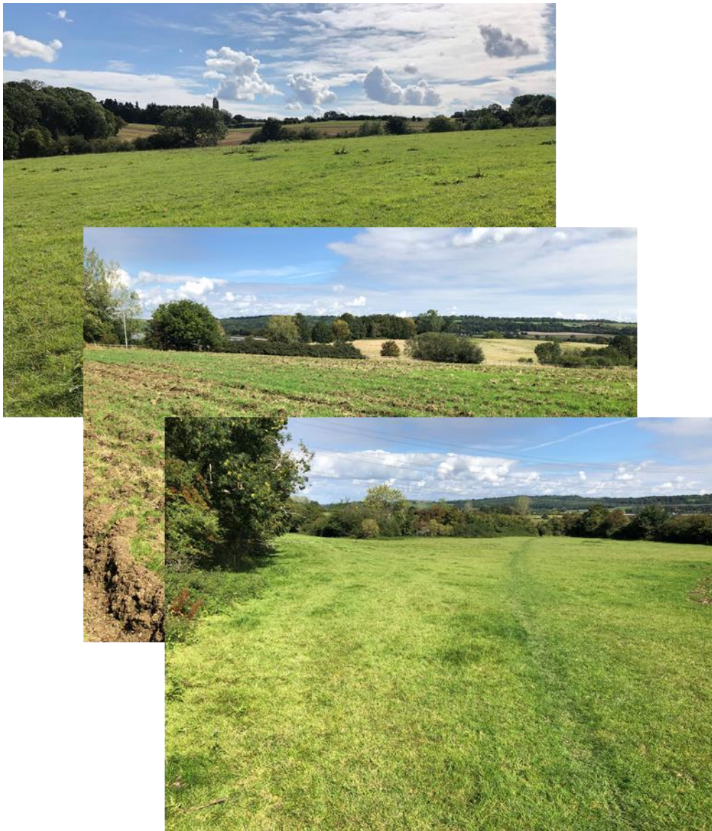
View 31 Smith Hill Copse

Content of View: From a northerly view down across Farmoor and up to the western edge of Wytham Woods, with Swinford in the distance, this view is of open farmland and mature stands of trees in an arc through to the south west towards the old ford at Bablock Hythe and the historic drovers road from the ford up to Leys Road.