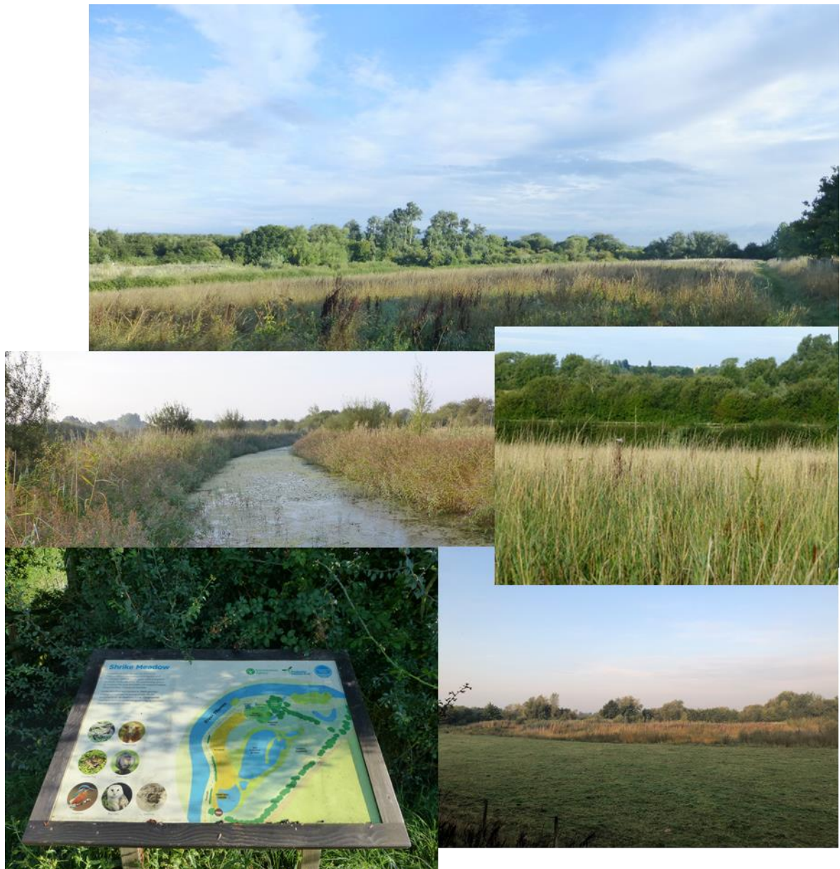
View 20a SW to NW from footpaths.