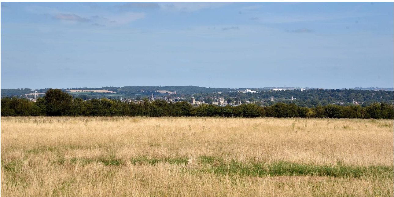
View 27 Dreaming spires of Oxford see from Chilswell Path near Powder Hill Copse.

Additional Evidence: Views include the 'dreaming spires of Oxford' as painted from Hinksey Hill by William Turner and referenced by Matthew Arnold in his poem “Thyrsis”. Cumnor NP Landscape Character Assessment Para 18.5.3