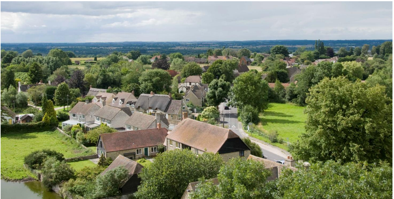
View 6a & c From St Michael's Church west over medieval village to Thames Valley and Cotswolds.

Content of View: From the top of the tower (open to the public on specified days) there are wide, expansive 360-degree views. Medieval village in foreground, to the north Wytham Woods and to the east The Hurst. Beyond the Important Views within the parish the Berkshire Downs can be seen to the south and Boars Hill to the South east.