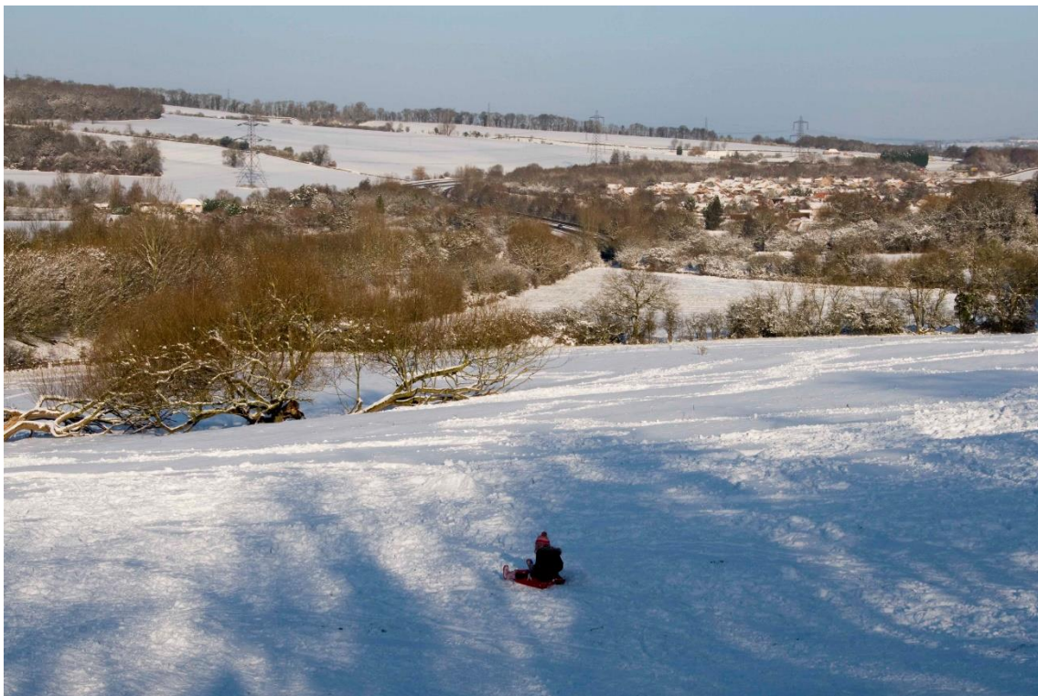
View 15 From Chawley Lane, looking through Dean Court to Wytham Hill.

Additional Evidence: There are views for approximately 3 miles to Wytham Woods when tree cover is low. The line of trees act as a visual barrier to the A420. Cumnor NP Landscape Character Assessment para15.5.2