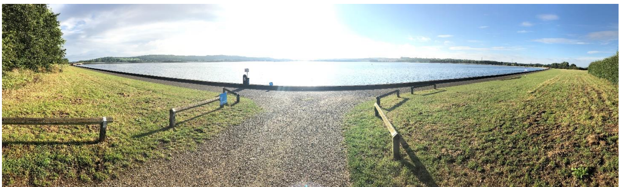
View 20b SE to NE From grassed banks of reservoir