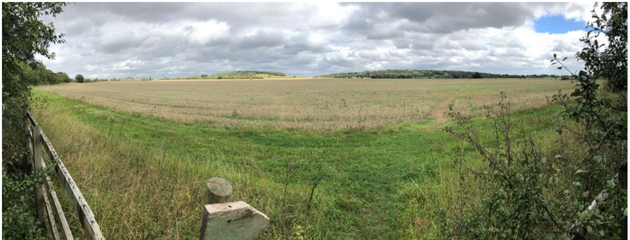
View 10 From footpath, panorama looking across to the Hurst and Youlbury.

Additional Evidence: Additional Information: The area is relatively open, with views across the arable farmland. This is a large scale landscape with large open fields relatively undisturbed by development. Long open views are visible from the Cumnor Bypass towards Didcot and Berkshire Downs. Cumnor NP Landscape Character Assessment para 17.5.5 & 17.5.6