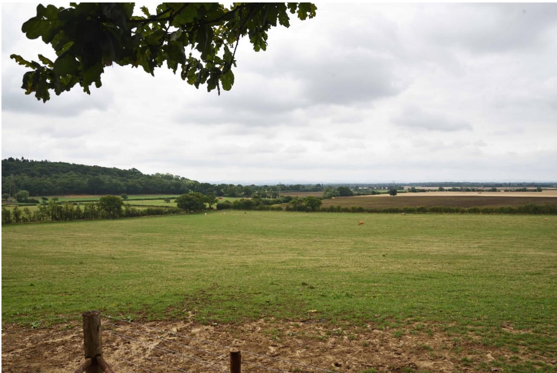
View 25 Youlbury Woods, Henwood and Berkshire Downs seen across land of Bradley Farm.

Additional Evidence: The area is relatively open, with views across the arable farmland. This is a large-scale landscape with large open fields undisturbed by development. Long open views beyond the parish extend towards Didcot and the Berkshire Downs. There are occasional long distant views of the North Wessex Downs AONB on the horizon. Cumnor NP Landscape Character Assessment para 17.5.5 & 17.5.6