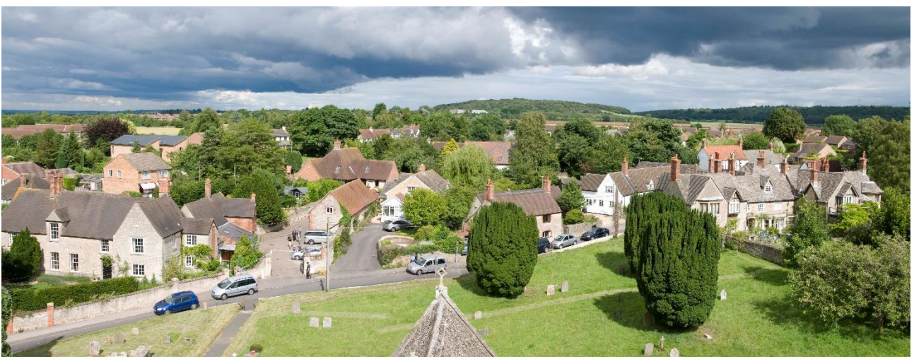
View 6b From St Michael's Church east over medieval village to Hurst Hill and Boars Hill.