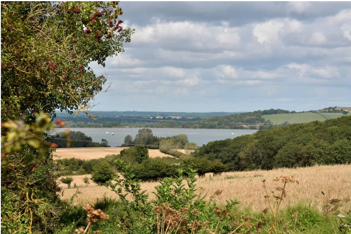
View 7 From footpath across Long Leys Meadow, showing Thames Valley and Farmoor Reservoir.

Content of View: From the public footpath across Long Leys Meadow, the view is of the Thames Valley and Farmoor Reservoir. It gently falls away to the north to capture Upper Whitley Farm and Whitley Brake. Foreground undulating arable fields, criss-crossed by mature hedgerows, background is the expanse of water of the reservoir.