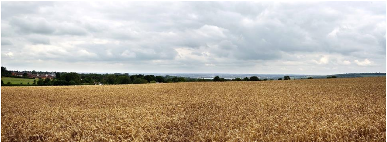
View 12c From Cumnor Beacon, looking Northwest over Cumnor Hill to Farmoor & beyond the Parish to West Oxfordshire