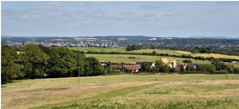
View 14a “Dreaming Spires of Oxford” from Chilswell Farm

Additional Evidence: From the southern point there are outstanding views out across to Oxford. Views include the ‘dreaming spires of Oxford’ as painted from Hinksey Hill by William Turner.