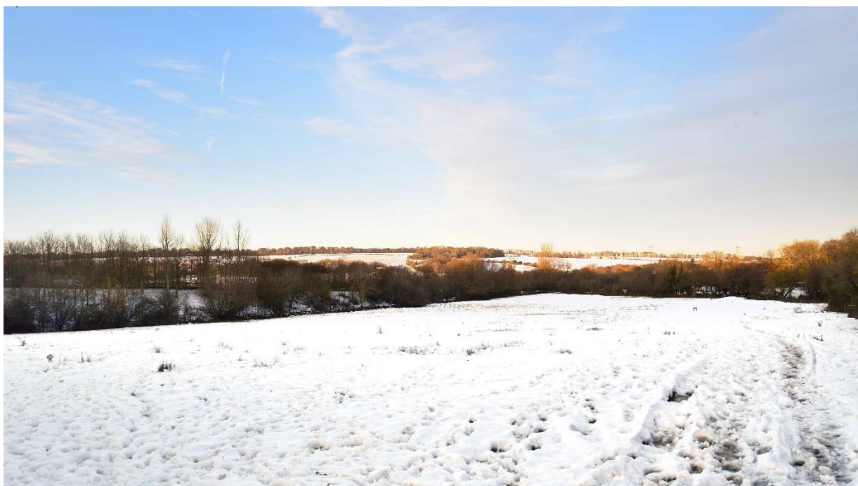
View 11 Dean Court Valley and Wytham Hill from Farm

Additional Evidence: There are many views out to the open countryside beyond the suburb from the area, including many glimpses between the widely spaced buildings. Some views are expansive, whilst others are framed by trees.