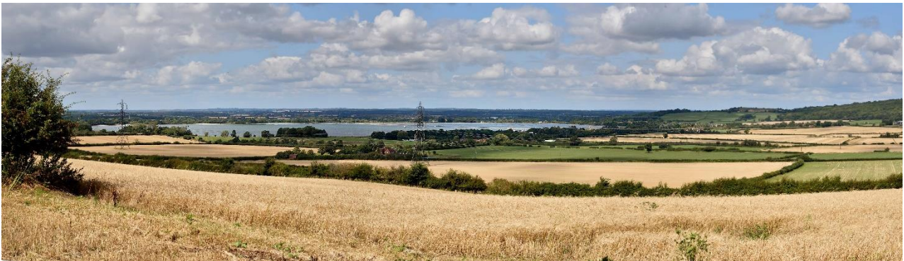
View 3 From Denman's Copse across Farmoor valley to Reservoir and Cotswold Hills.

Additional Evidence: The north facing slopes have wide views over the Thames Vale, including Farmoor reservoir, as well as views of rising ground including wooded Wytham Hill on the horizon to the north. There are panoramic views north from the B4017 which is nearby. Cumnor NP landscape Character assessment LCA 12 Para 12.5.2