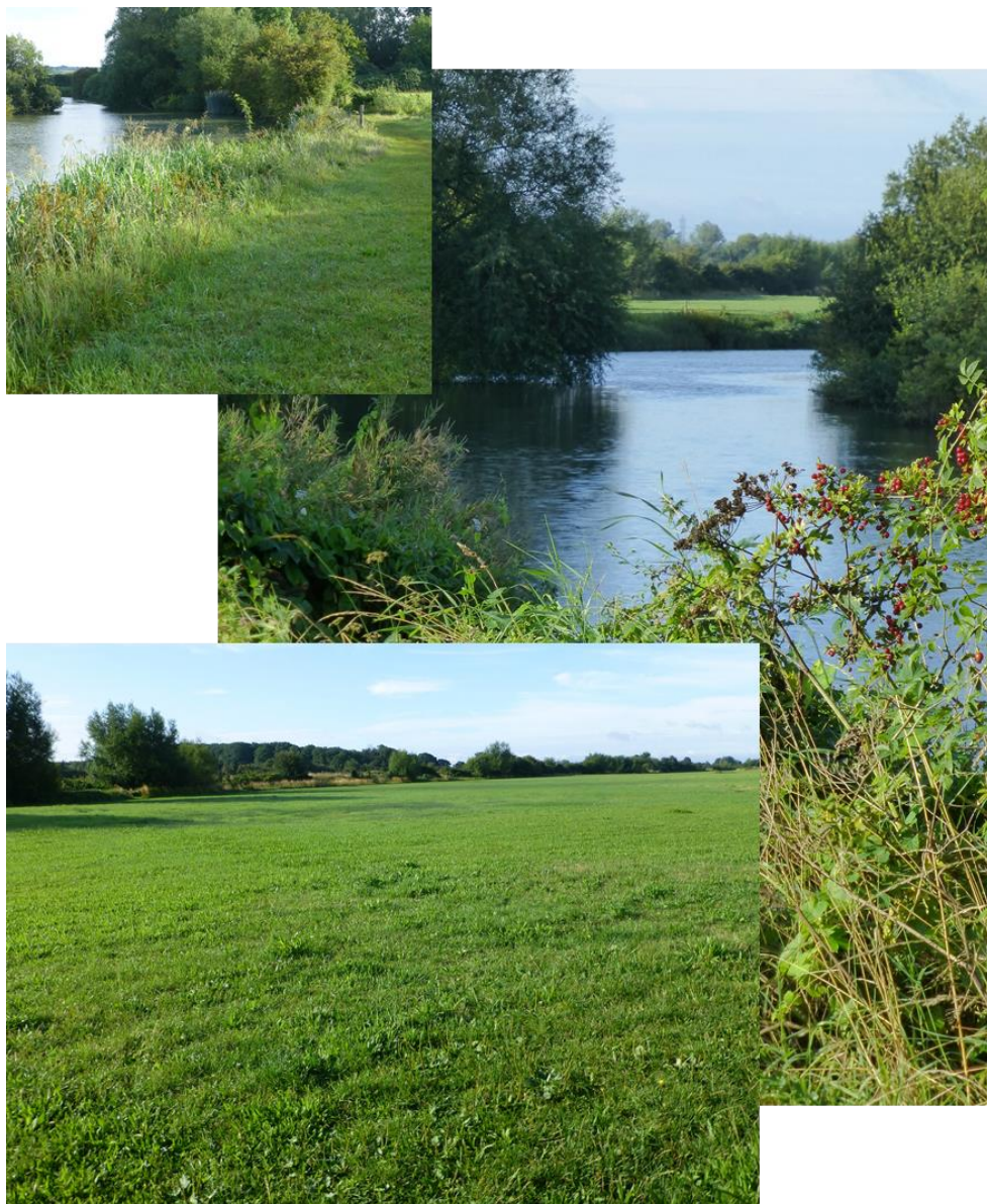
View 21 View from Thames side path view looking South & South East

Additional Evidence: Extensive river and river bank views inside the Parish boundary opening up to long distance SE views across open pasture to the woods climbing from Bablock Hythe past the Physic Well. Cumnor NP landscape Character assessment Para 6.5.2