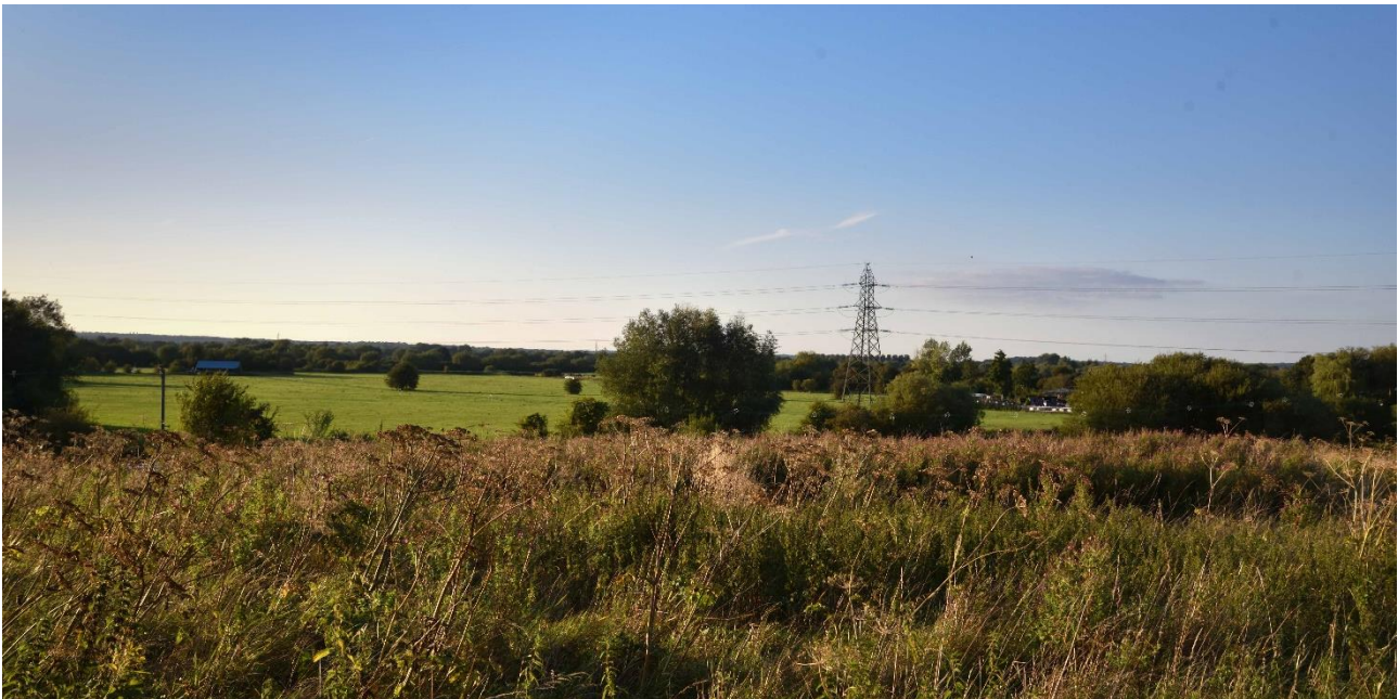
View 18 From near Pinkhill along East bank of Thames from Pinkhill lock to boatyard

Additional Evidence: The parish boundary crosses the Thames twice in this area returning to the west bank in photo below. Cumnor NP landscape Character assessment Para 6.5.2