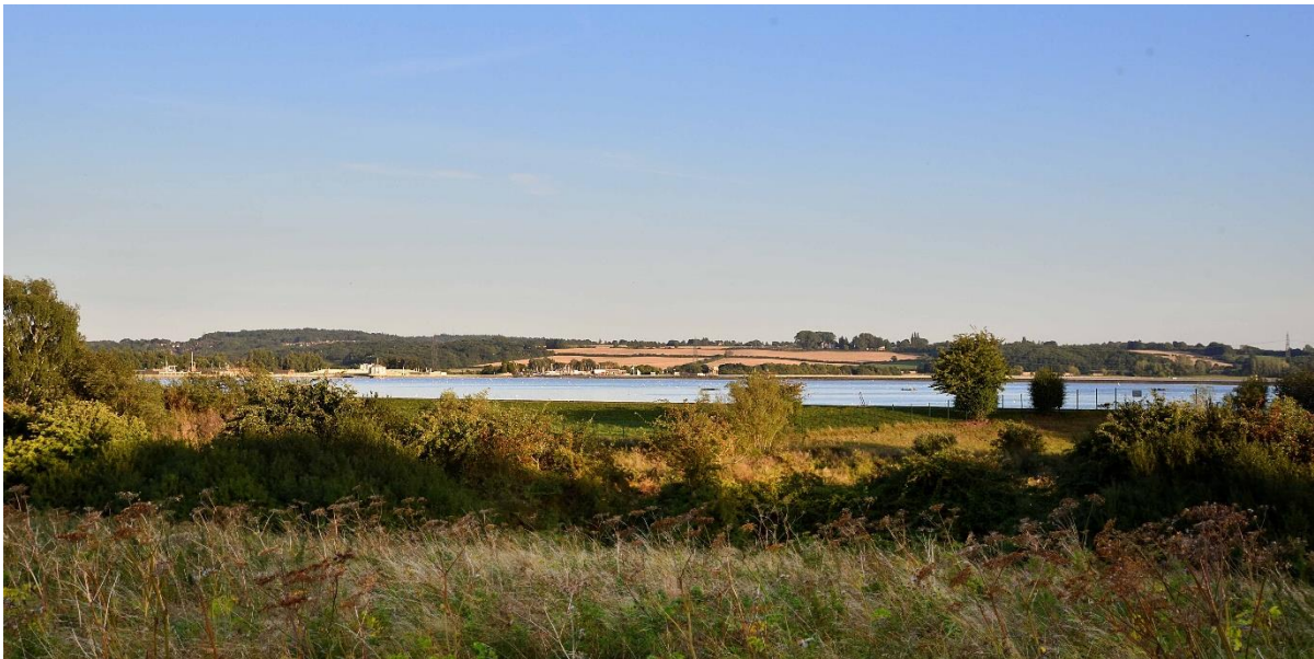
View 17 From near Pinkhill across Farmoor Reservoir to Tumbledown.

Additional Evidence: There are views across the large waterbody of the reservoir from the top of the surrounding embankment, including from the public footpath adjacent to the south-western edge of the reservoir. The reservoir is a prominent feature in views from the elevated locations which overlook the area to the north, east and south. Cumnor NP landscape Character assessment Para 6.5.2