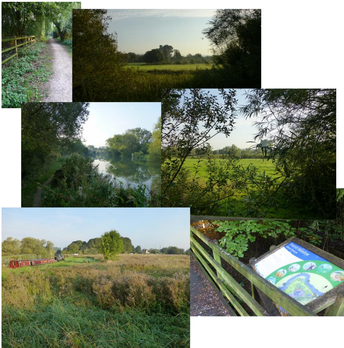
View 19 Pinkhill Meadow Nature Reserve from surrounding footpaths

Additional Evidence: The success of Pinkhill Nature Reserve has served as a model for others, including the adjacent Shrike Meadow to the south – see Important View 20a. Cumnor NP landscape Character assessment Para 6.5.2