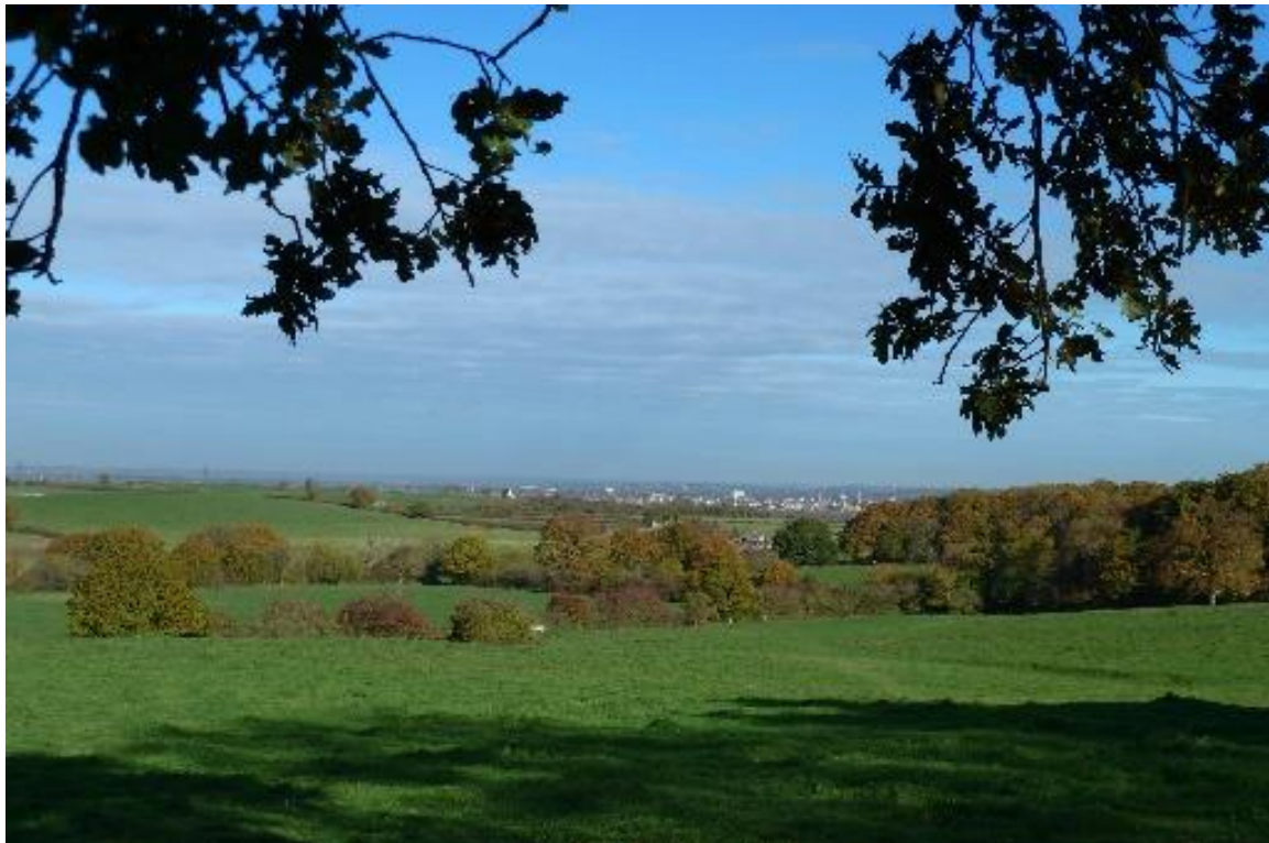
View 29 Dreaming spires of Oxford from farmland close to Chilswell Farm Cottages.

Additional Evidence: From the southern point there are outstanding views out across to Oxford. Cumnor NP Landscape Character Assessment Para 18.5.3