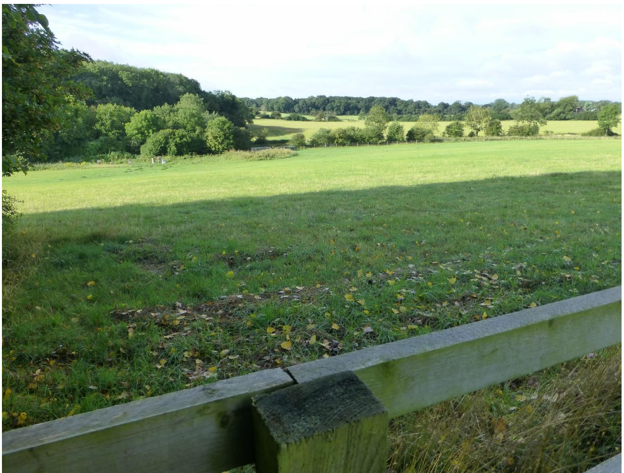
View 22 From elevated footpath looking south west

Content of View: From beehives in the foreground to the woods rising from Bablock Hythe in the distance this kinetic view across agricultural land changes as you move along the public footpath.