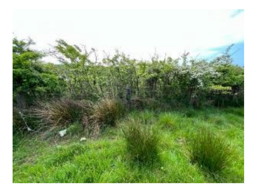
Photograph 4: Static location 4