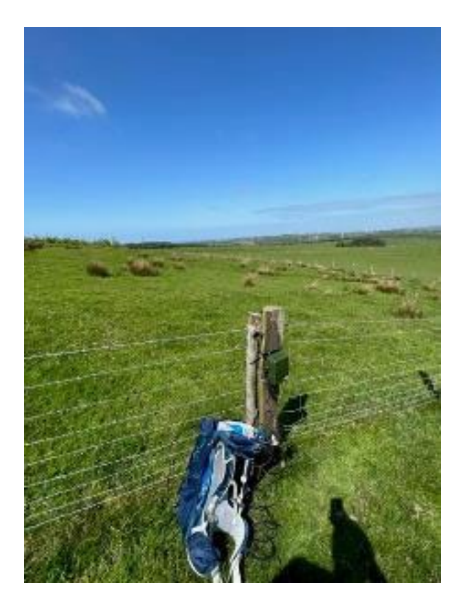
Photograph 3: Static location 3