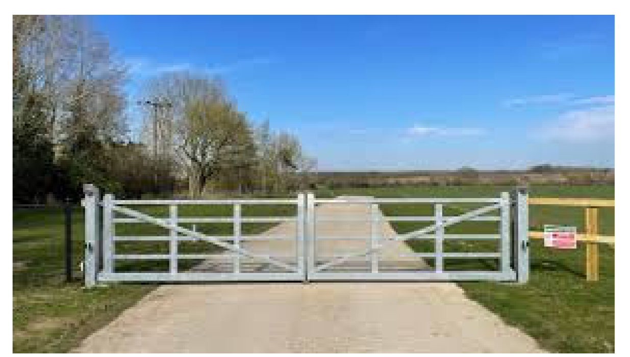
TYPICAL STYLE OF GATE