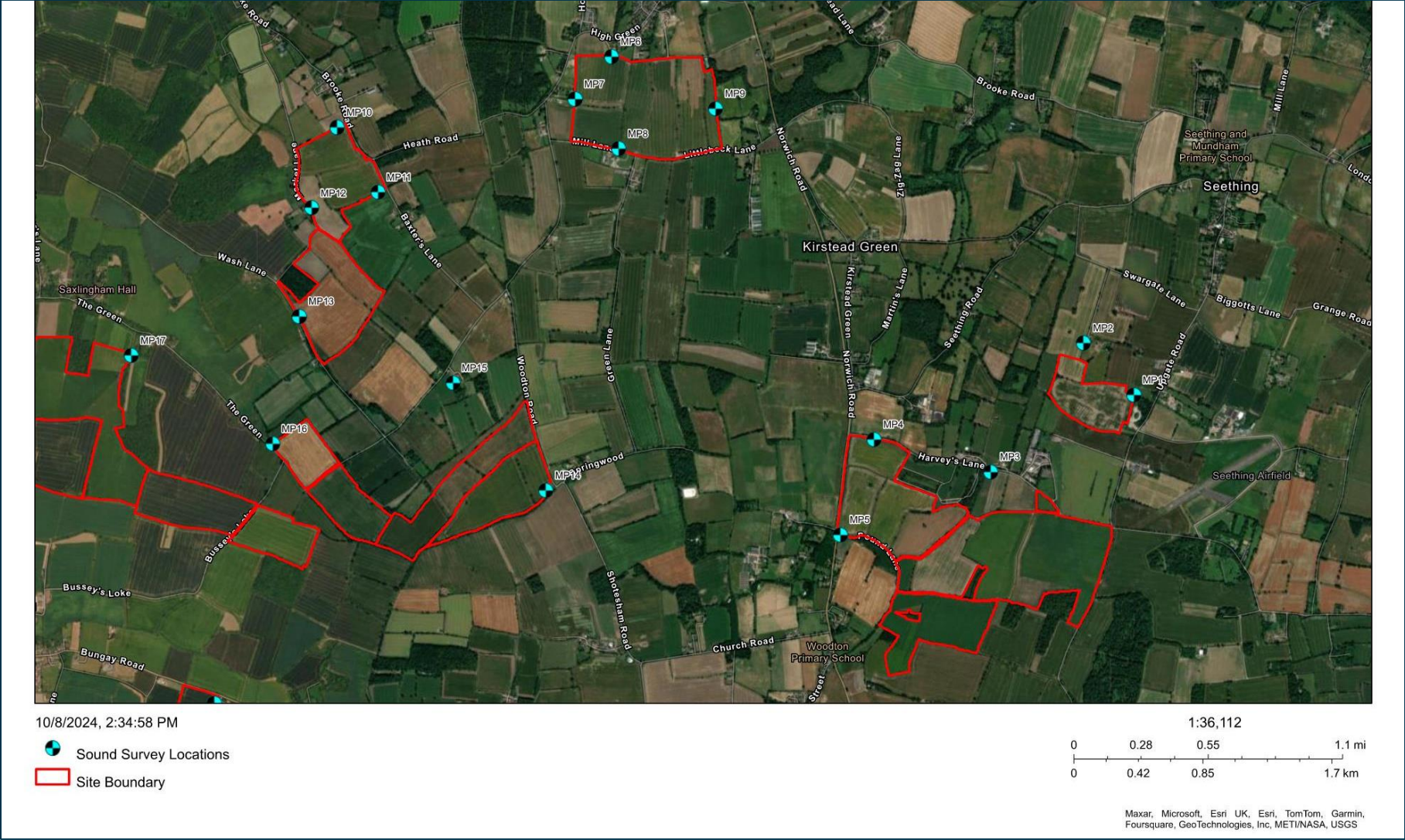
Figure 3: Environmental Sound Survey Locations A (Contains Esri UK, Esri, TomTom, Garmin, Foursquare, GeoTechnologies, Inc, METI/NASA, USGS | Earthstar Geographics)