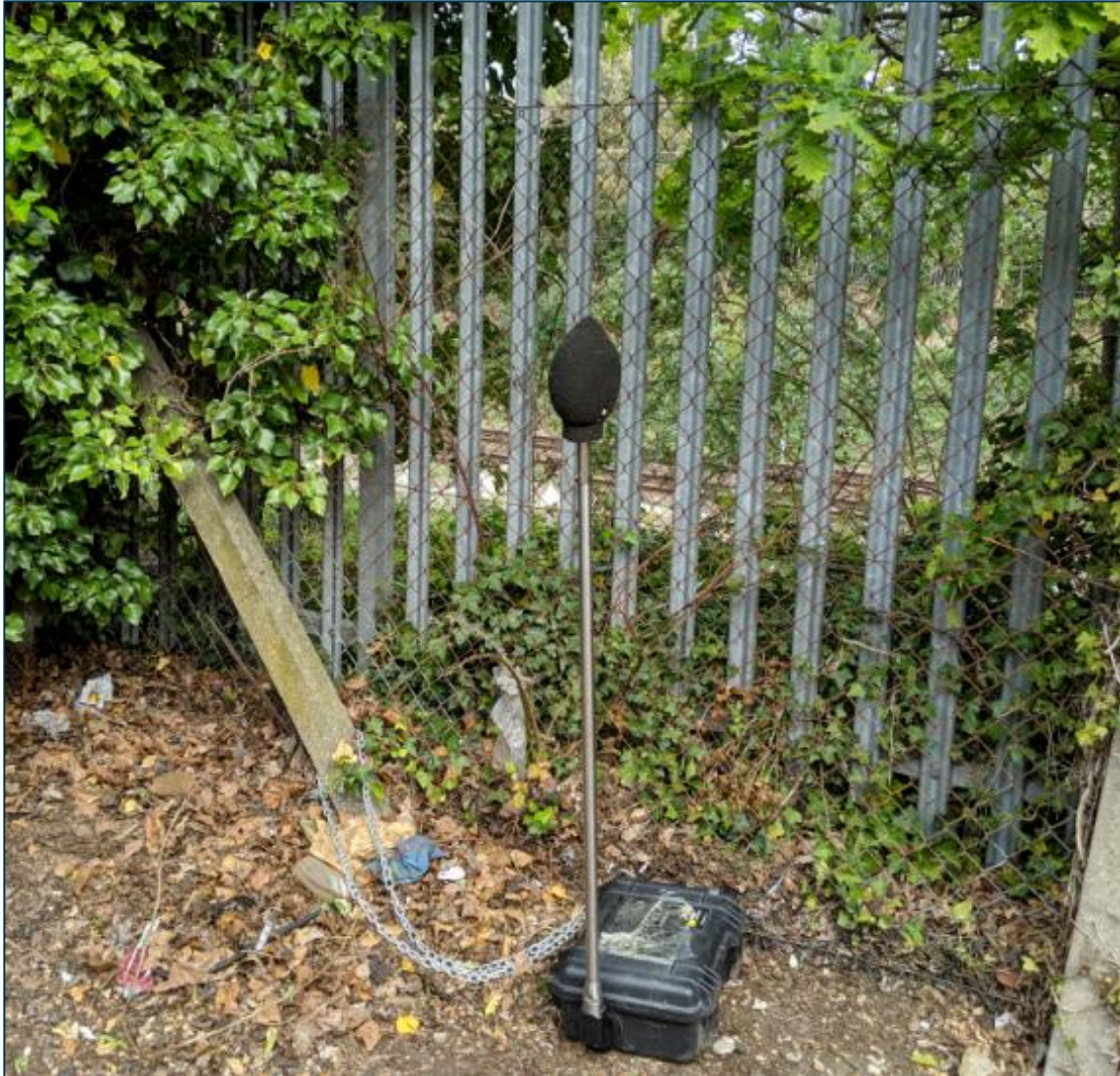
Figure 1: Typical Sound Monitoring Equipment Set Up