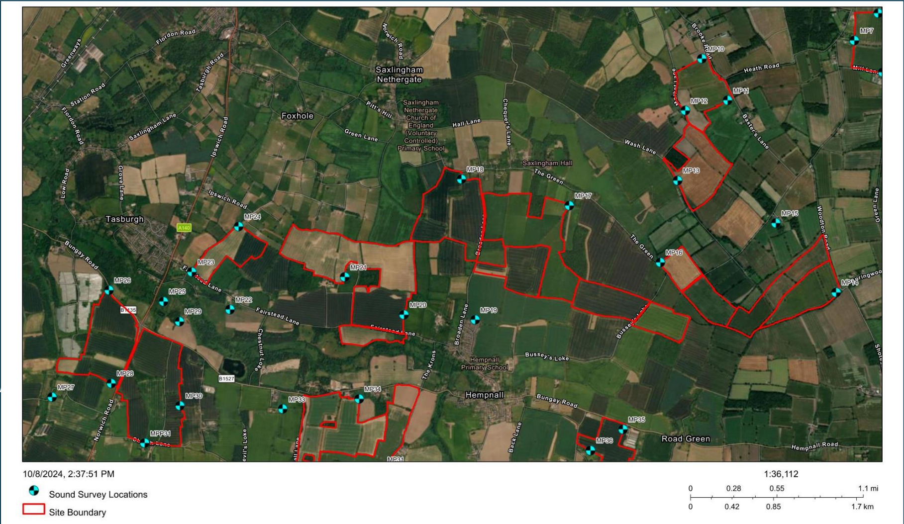
Figure 4: Environmental Sound Survey Locations B (Contains Esri UK, Esri, TomTom, Garmin, Foursquare, GeoTechnologies, Inc, METI/NASA, USGS | Earthstar Geographic)