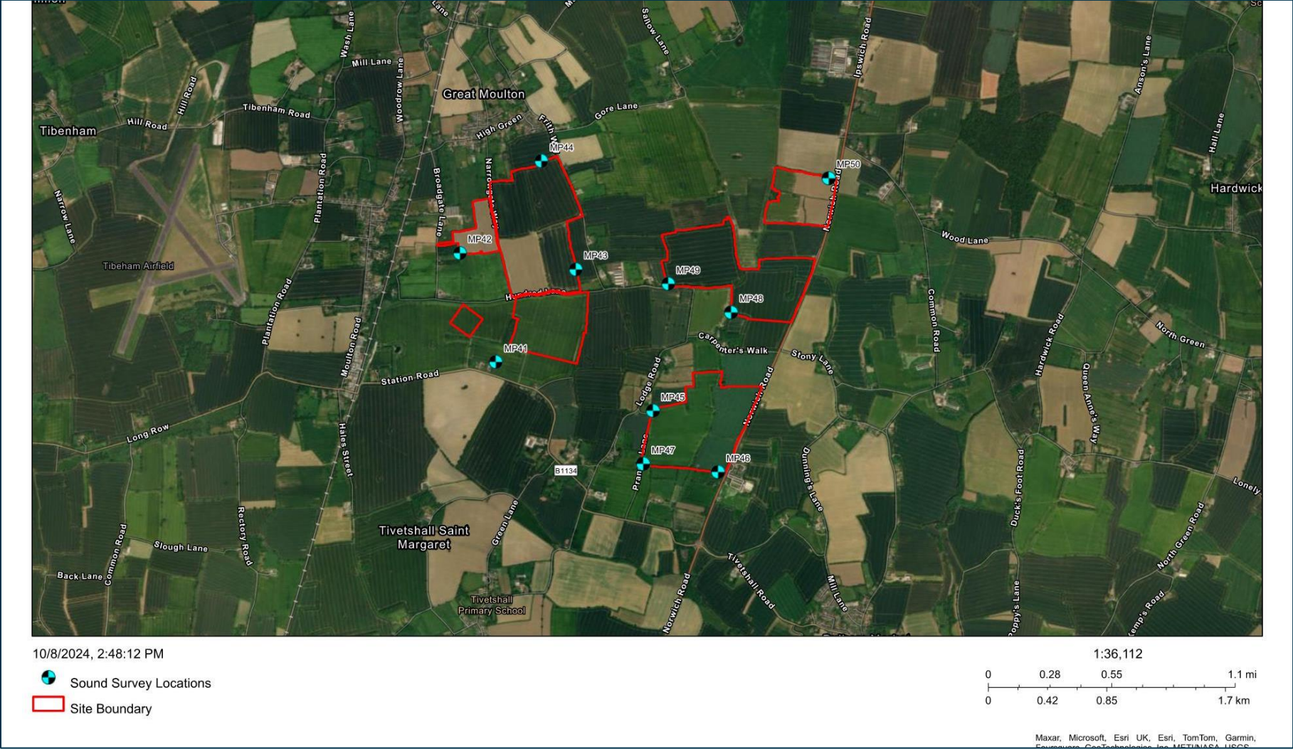
Figure 6: Environmental Sound Survey Locations D (Contains Esri UK, Esri, TomTom, Garmin, Foursquare, GeoTechnologies, Inc, METI/NASA, USGS | Earthstar Geographics)