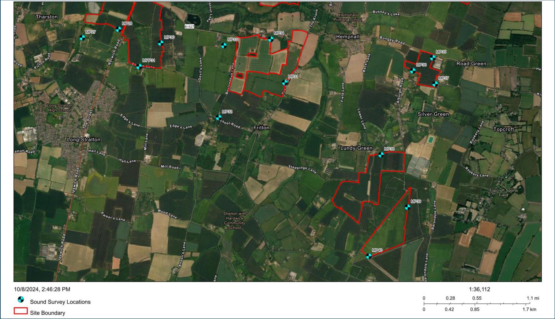
Figure 5: Environmental Sound Survey Locations C (Contains Esri UK, Esri, TomTom, Garmin, Foursquare, GeoTechnologies, Inc, METI/NASA, USGS | Earthstar Geographics)