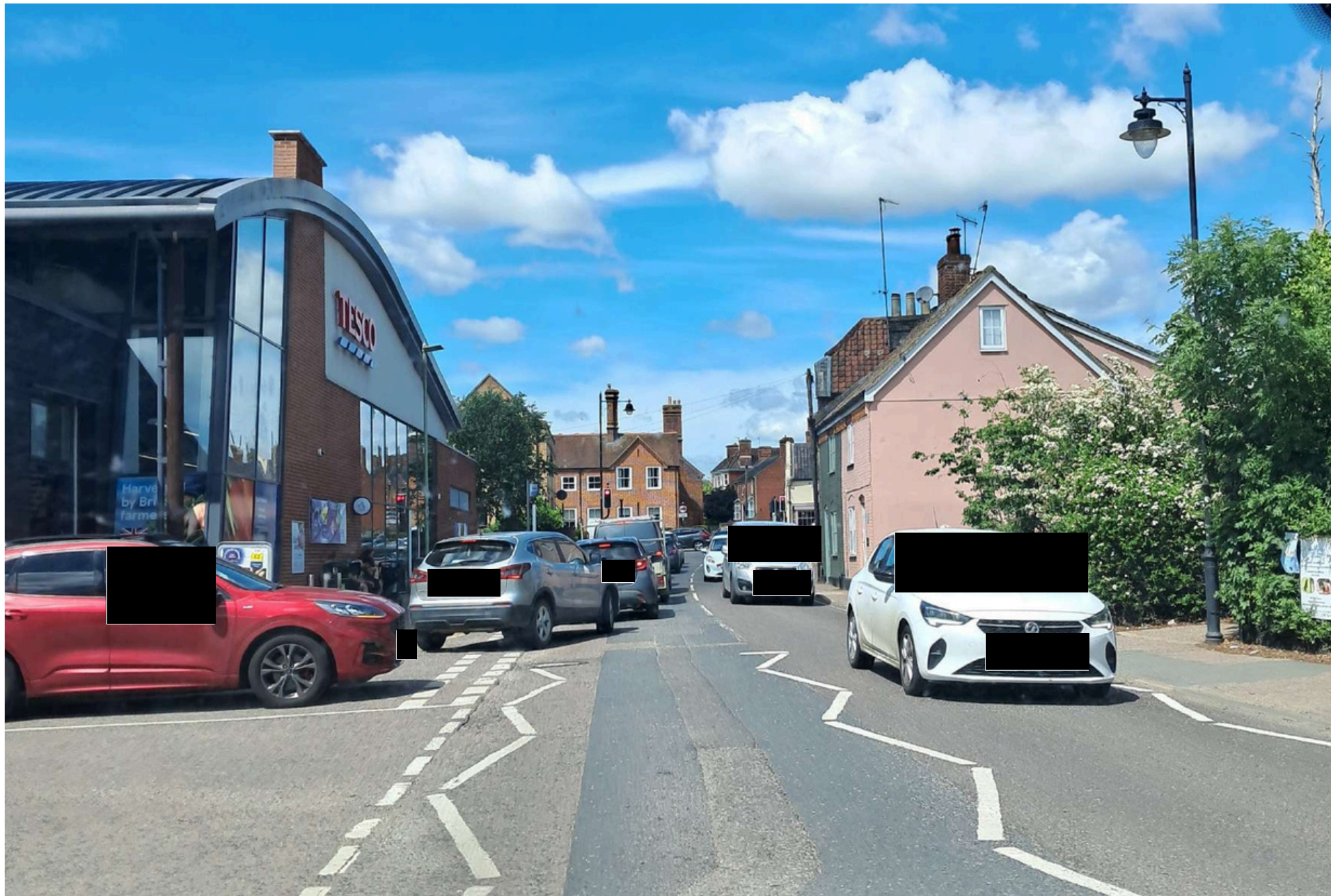
Sea Link - Relevant Representation - Appendix 2 - Church Street Traffic