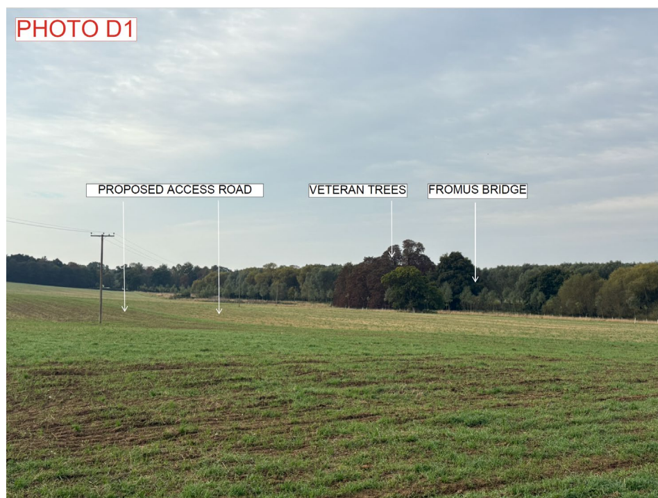
PHOTO D1: View looking south towards proposed Fromus bridge and access road which if consented will cut through the field towards the converter stations site lying east.

Continue around residential dwellings to Point D on the map which is the agricultural field perimeter.