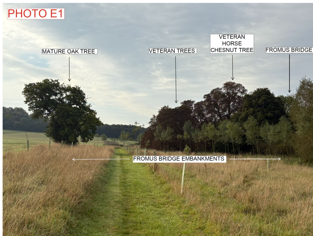
PHOTO E1: View looking south towards proposed Fromus bridge crossing.

Continue around field perimeter to the location of the proposed bridge