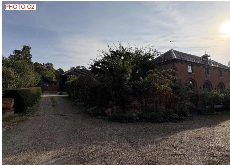
PHOTO C2: A total of 5 residential dwellings sit behind Hurts Hall within its curtilage (Photograph C2 shows 2 such dwellings). All dwellings will experience adverse impacts from the construction and operation from the proposed Fromus bridge crossing, access road and converter stations site.

Continue around residential dwellings to Point D on the map which is the agricultural field perimeter.