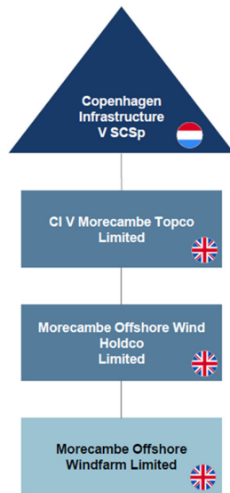
Morecambe Corporate structure post-change of control

1.4.3.3 CIP was founded in 2012 and is the world's largest dedicated fund manager focused on renewable energy investments. It manages over €32 billion in assets over 13 different funds. CIP has a 50GW Global Offshore Wind portfolio and across over 30 different markets has over 160GW of renewable energy projects in development. Within the UK, CIP has a 25GW pipeline, including a 30% share in the Ossian Offshore Wind Farm in Scotland - at up to 3.6 GW capacity this will be one of the world's largest floating offshore wind farms. CIP is also the