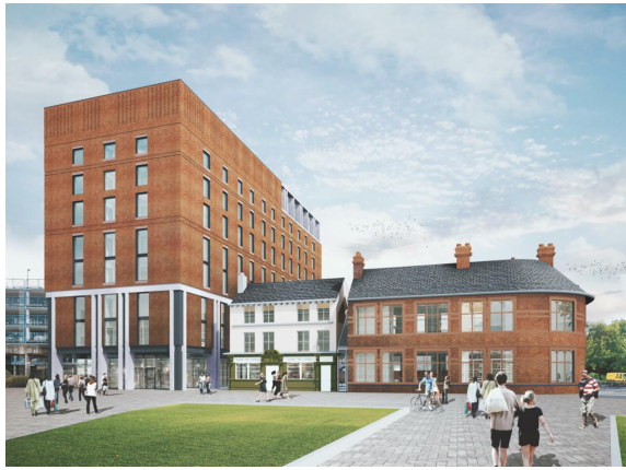
VIEW OF PROPOSED BUILDINGS AND PUBLIC REALM