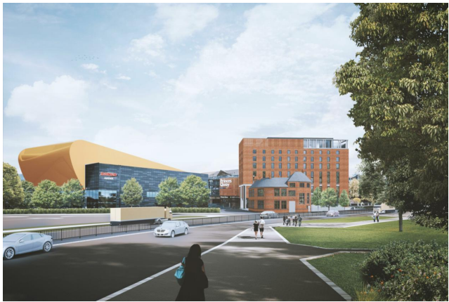
APPROACH FROM A63 WEST