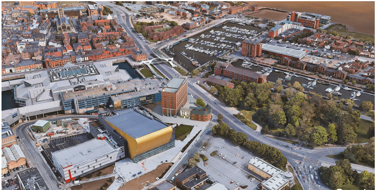
AERIAL VIEW OF PROPOSAL IN THE CONTEXT OF HULL BONUS ARENA, HULL MARINA, HULL MINSTER, THE OLD TOWN AND PROPOSED NEW