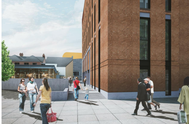
APPROACH FROM HULL MARINA - VIEW OF PROPOSED BUILDINGS