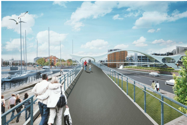
APPROACH FROM HULL MARINA AND PROPOSED NEW PEDESTRIAN