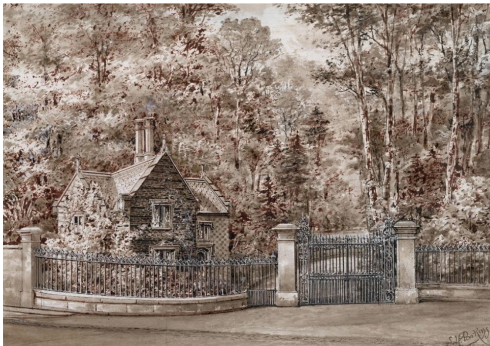
Plate 4: Markeaton Park entrance and lodge on Ashbourne Road, painted by S.H. Parkins (1921) (black and white image of a colour painting)