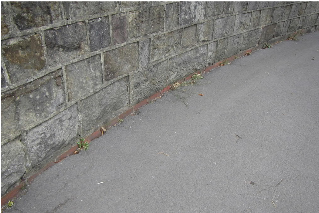
Plate 6: Engineering bricks at base of Markeaton Park boundary wall (A40)