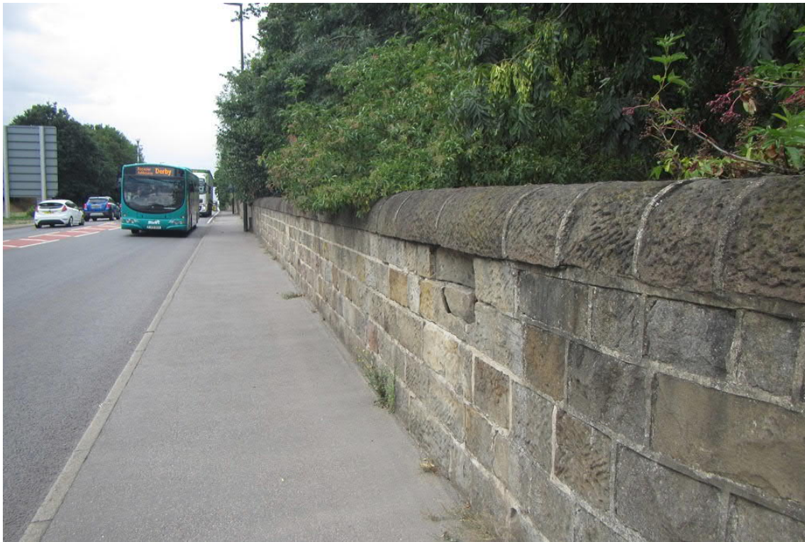
Plate 5: Markeaton Park boundary wall (A40) along Ashbourne Road