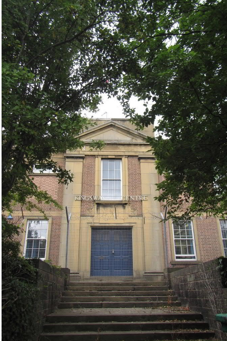
Plate 7: Kingsway Army Reserves Centre