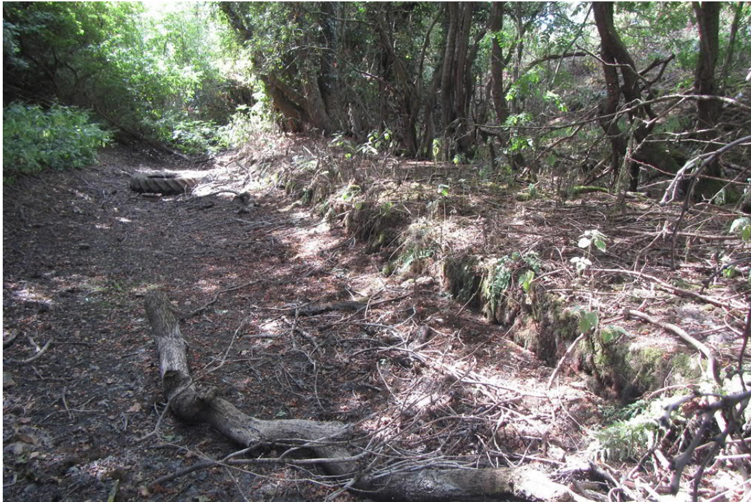
Plate 1: Derby Canal (Little Eaton branch) north of Ford Farm