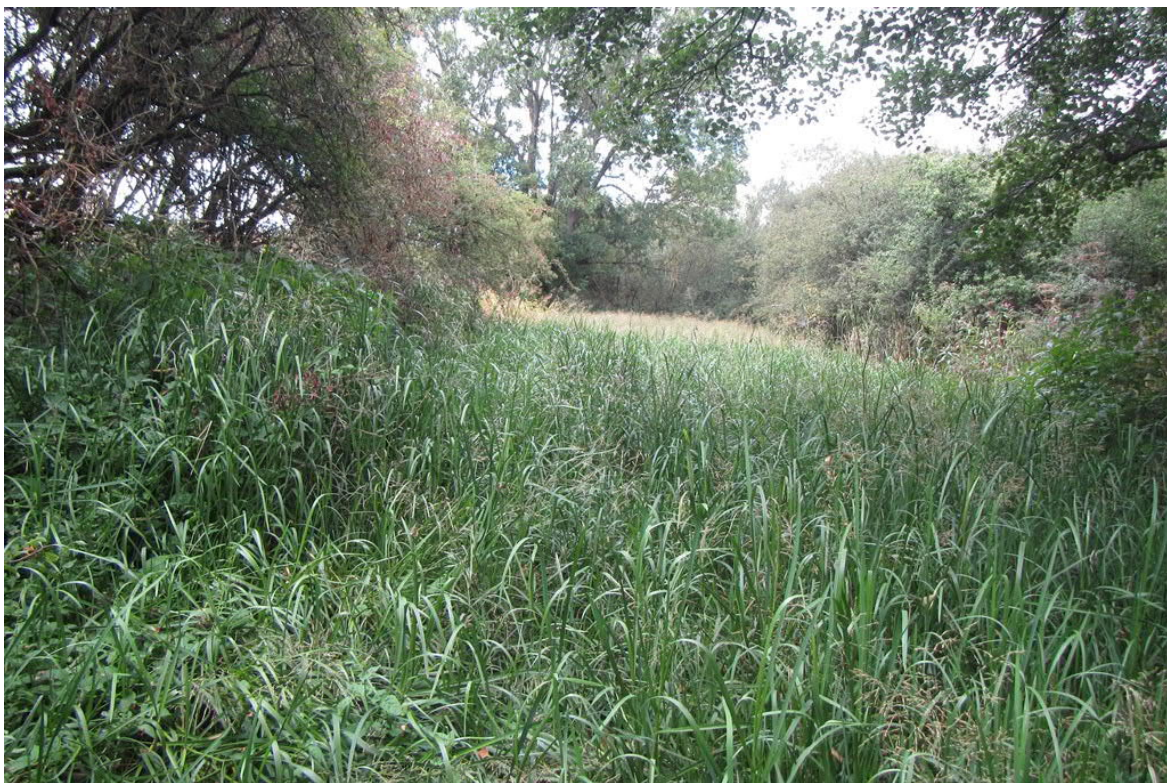
Plate 2: Derby Canal (Little Eaton branch) south of Little Eaton junction