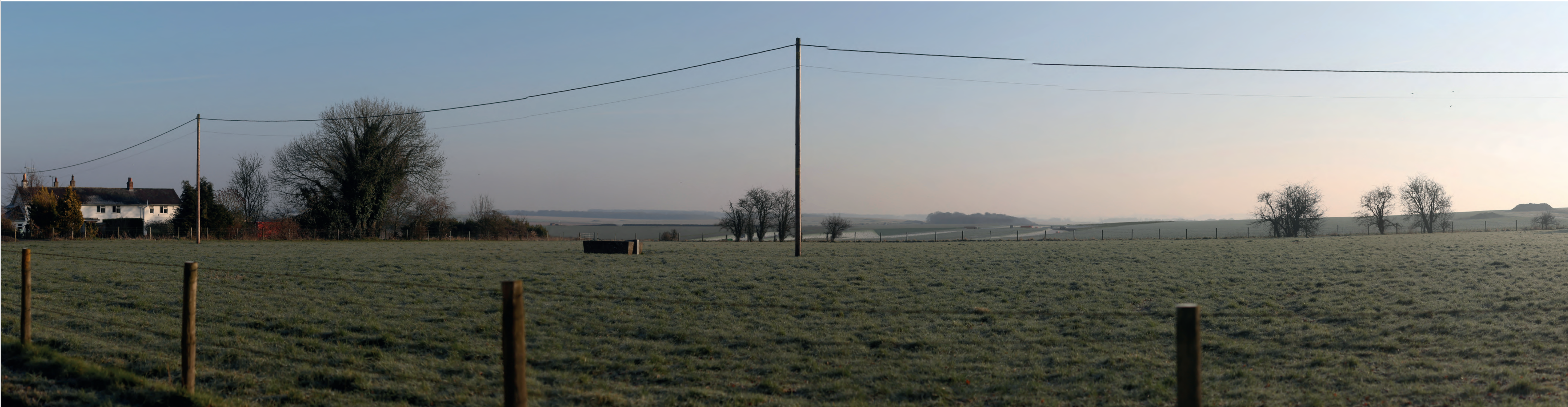
PROPOSED (WINTER YEAR 1)

Images to be viewed at a comfortable arm's length.