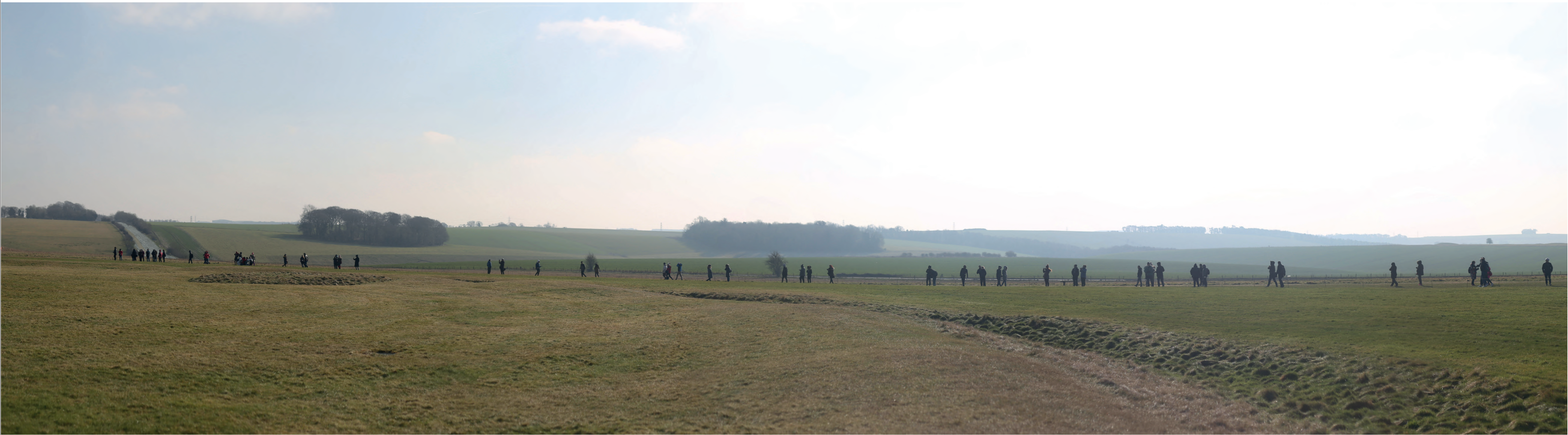
PROPOSED (WINTER YEAR 1)

Images to be viewed at a comfortable arm's length.