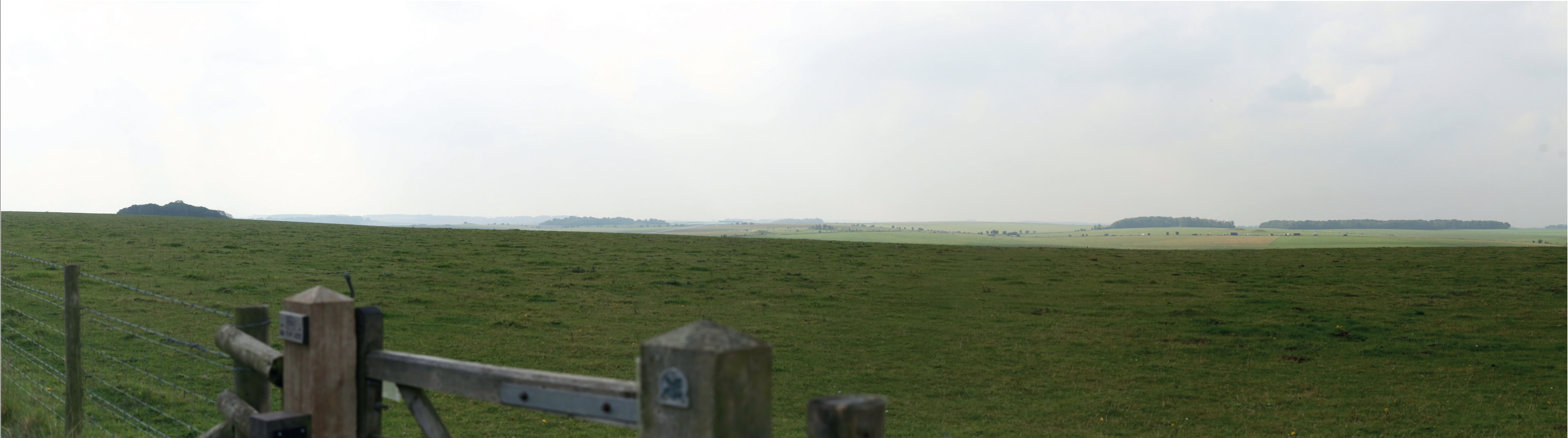
PROPOSED (SUMMER YEAR 15)

Images to be viewed at a comfortable arm's length.