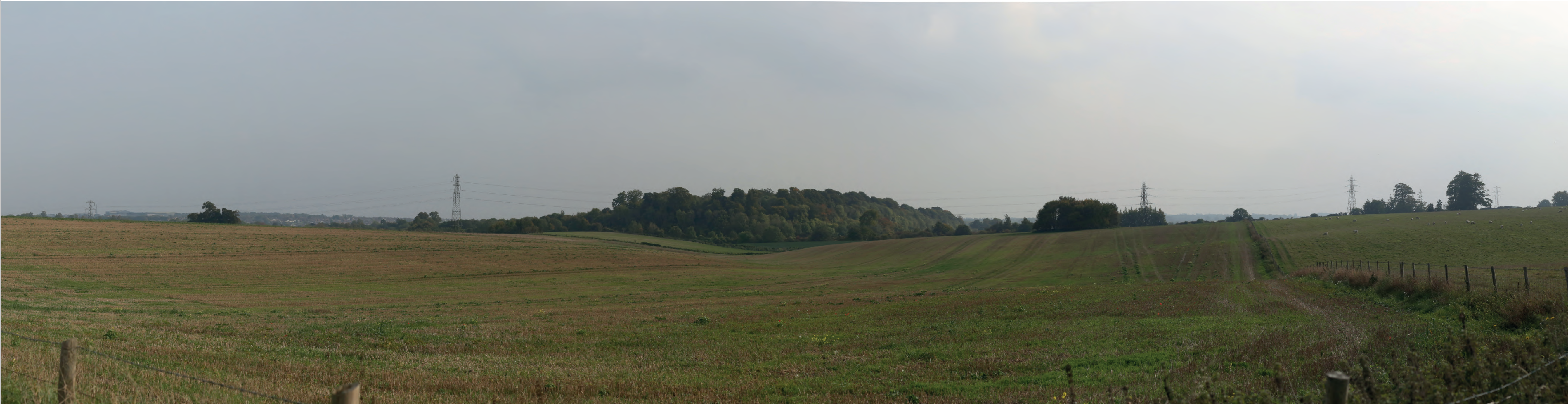
PROPOSED (SUMMER YEAR 15)

Images to be viewed at a comfortable arm's length.