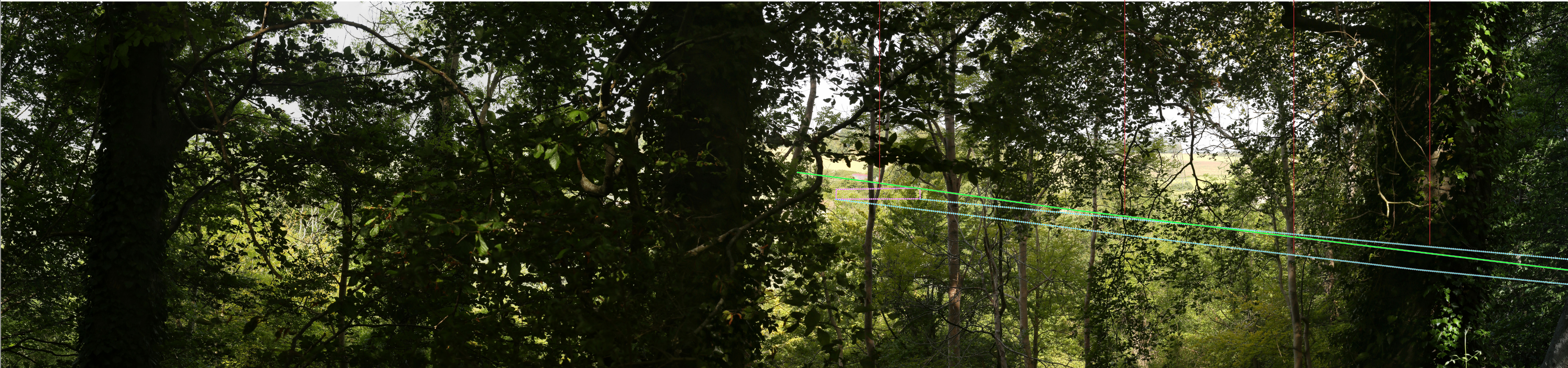
PROPOSED (SUMMER YEAR 15)

Images to be viewed at a comfortable arm's length.