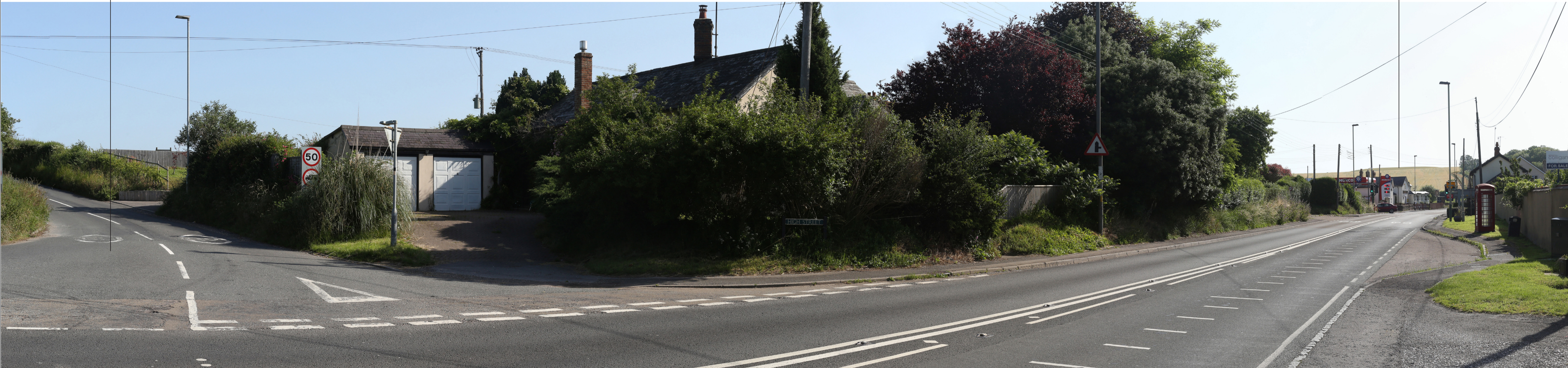
PROPOSED (SUMMER YEAR 15)

Images to be viewed at a comfortable arm's length.