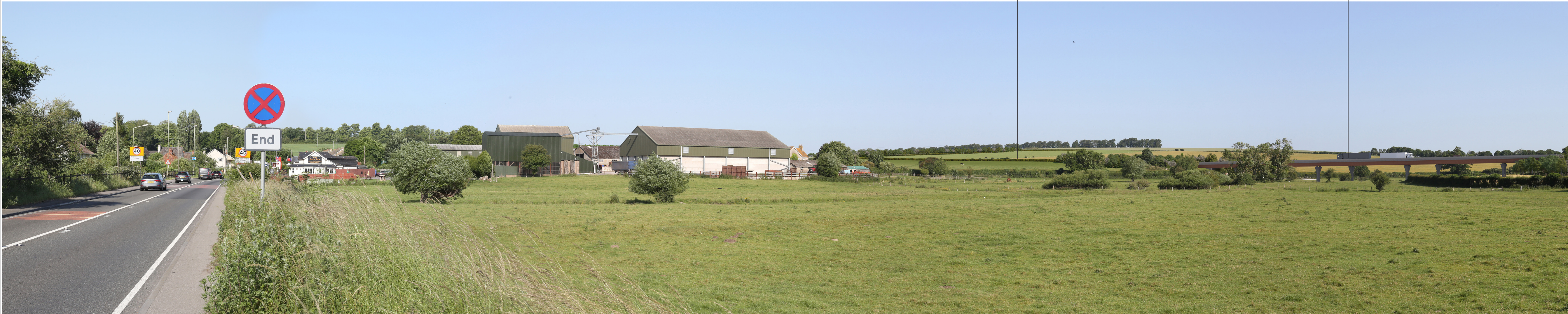
PROPOSED (SUMMER YEAR 15)

Images to be viewed at a comfortable arm's length.