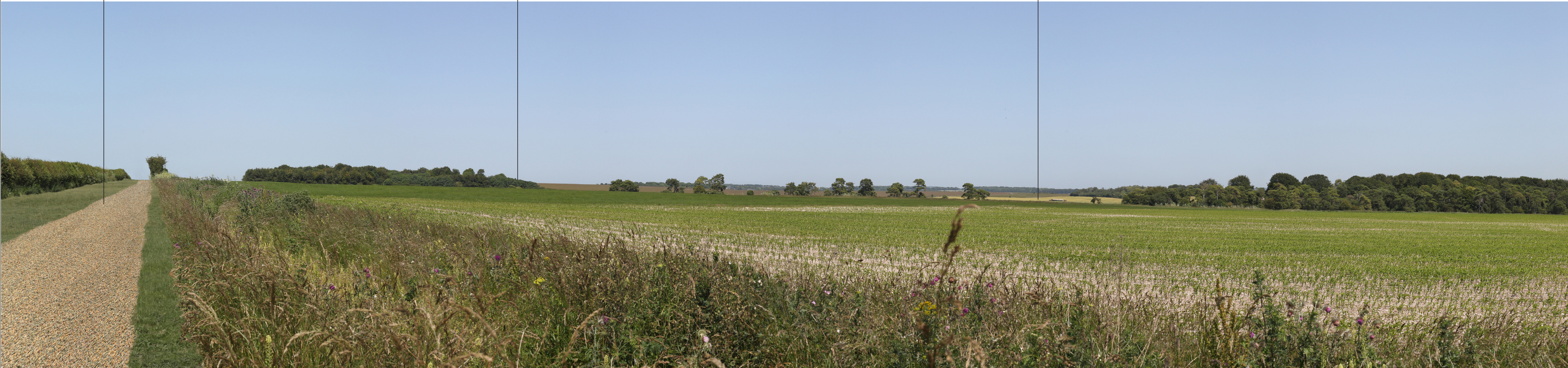
PROPOSED (SUMMER YEAR 15)

Images to be viewed at a comfortable arm's length.